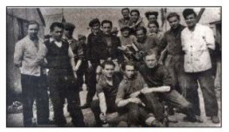
Former soldiers of the Galicia Division at the Hallmuir POW camp near Lockerbie, Scotland. 1948.

In May 1945, when Germany surrendered to the Allied Powers, the Galicia Division was based in Austria. Retreating westwards to avoid capture by the advancing Soviet Red Army, most of its members (about 10,000) surrendered to the British Army and were temporarily interned near Spittal. The Soviet authorities claimed that the Ukrainian members of the division were