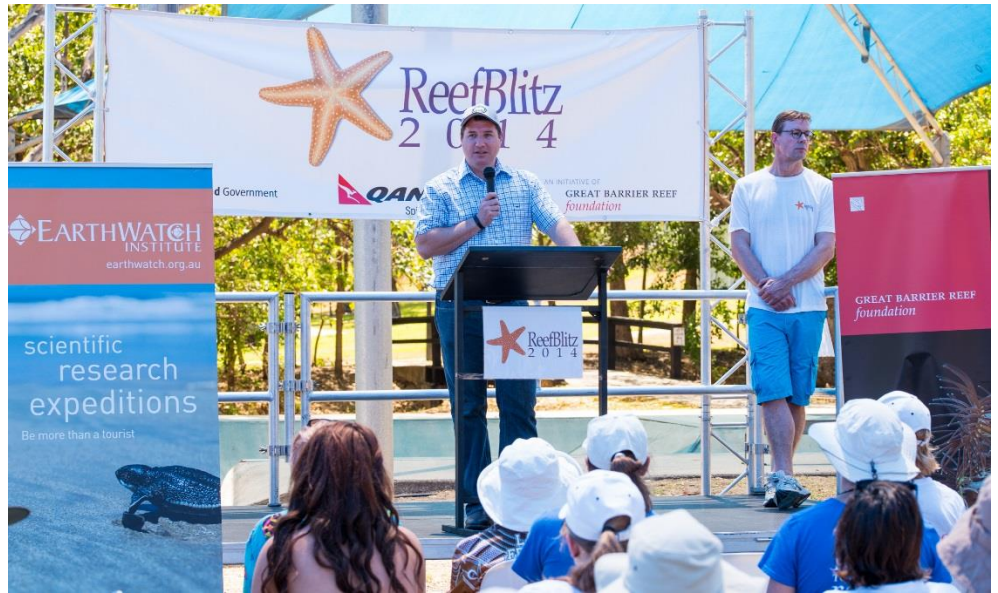
Figure 6: Official launch event of ReefBlitz, with Hon. Andrew Powell