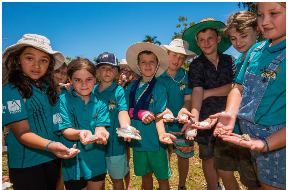
Figure 7: PCYC group participating at ReefBlitz 2014

A range of plant and animal species were observed during the event, including 118 animals and 72 plant species.