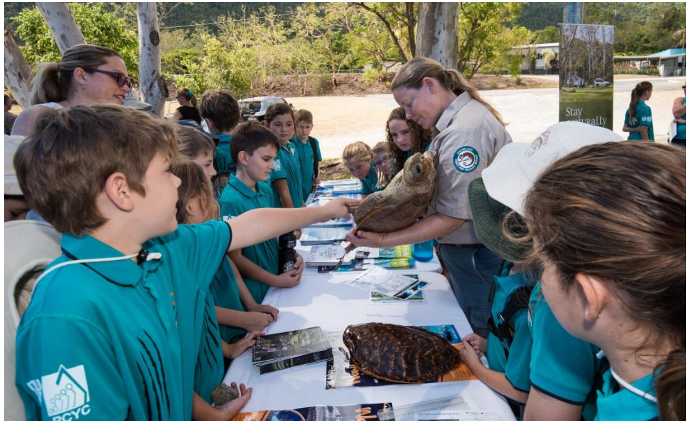
Figure 2: Queensland Parks and Wildlife Service display at basecamp

The basecamp was set up at Cannonvale Beach. The basecamp was the hub of the ReefBlitz festival, with all surveys leaving from here. Several community-based citizen science groups had stalls set up at basecamp. The local school also ran a fundraising barbeque at the basecamp.