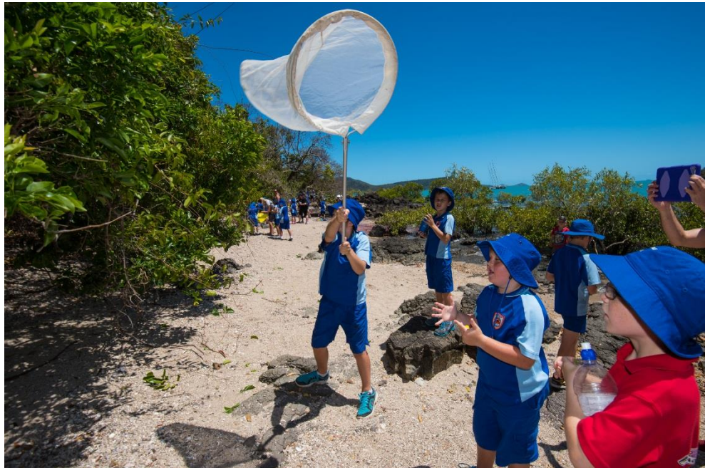
Figure 8: School children in action at ReefBlitz 2014