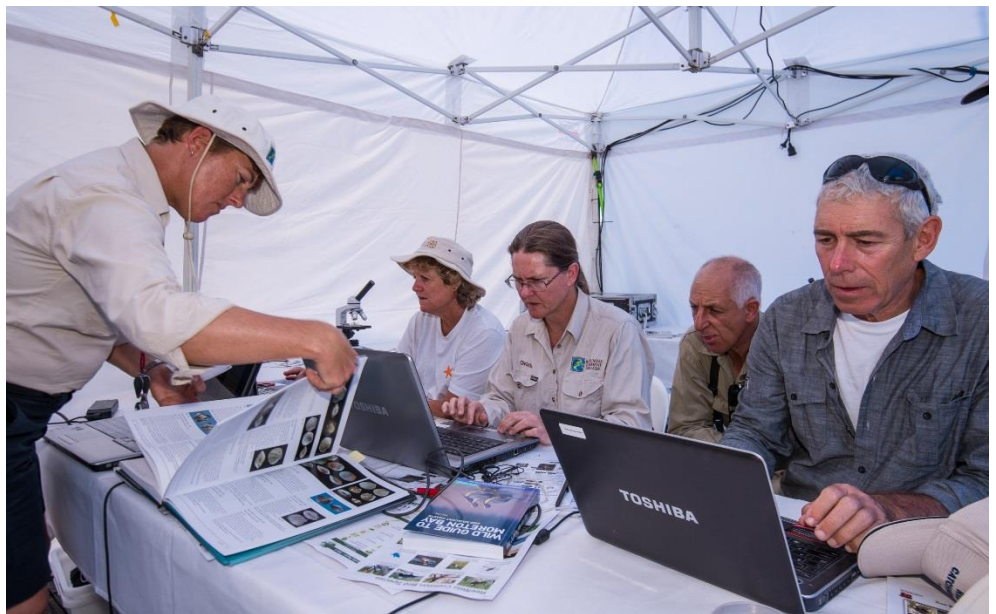
Figure 3: Species identification at basecamp

There were a range of species identification tools at basecamp, such as microscopes, species ID guides, and a live feed of biodiversity observations through the iNaturalist website.