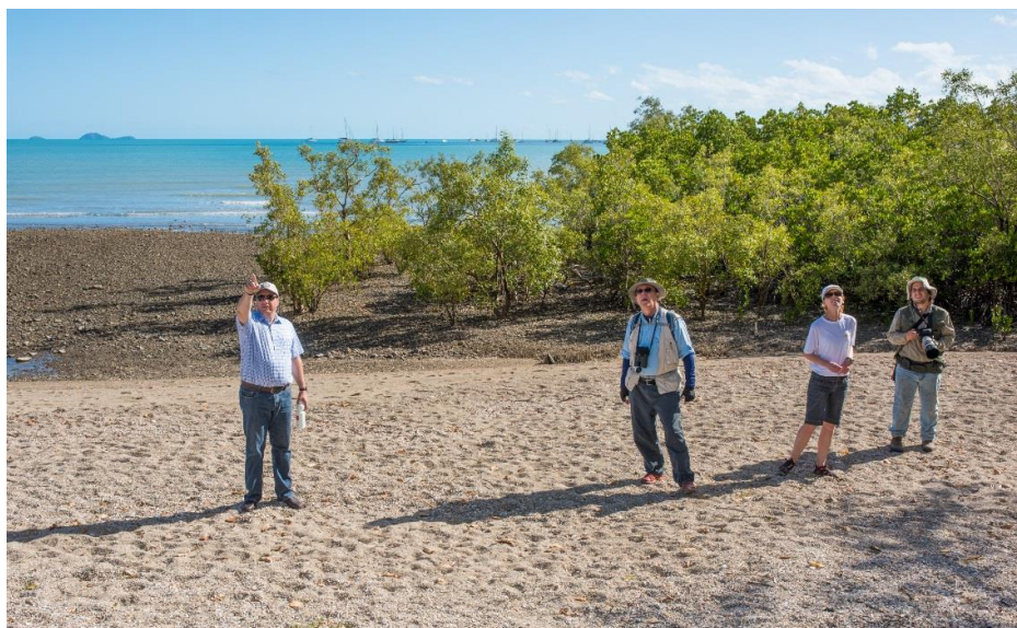
Figure 9: Bird watching survey