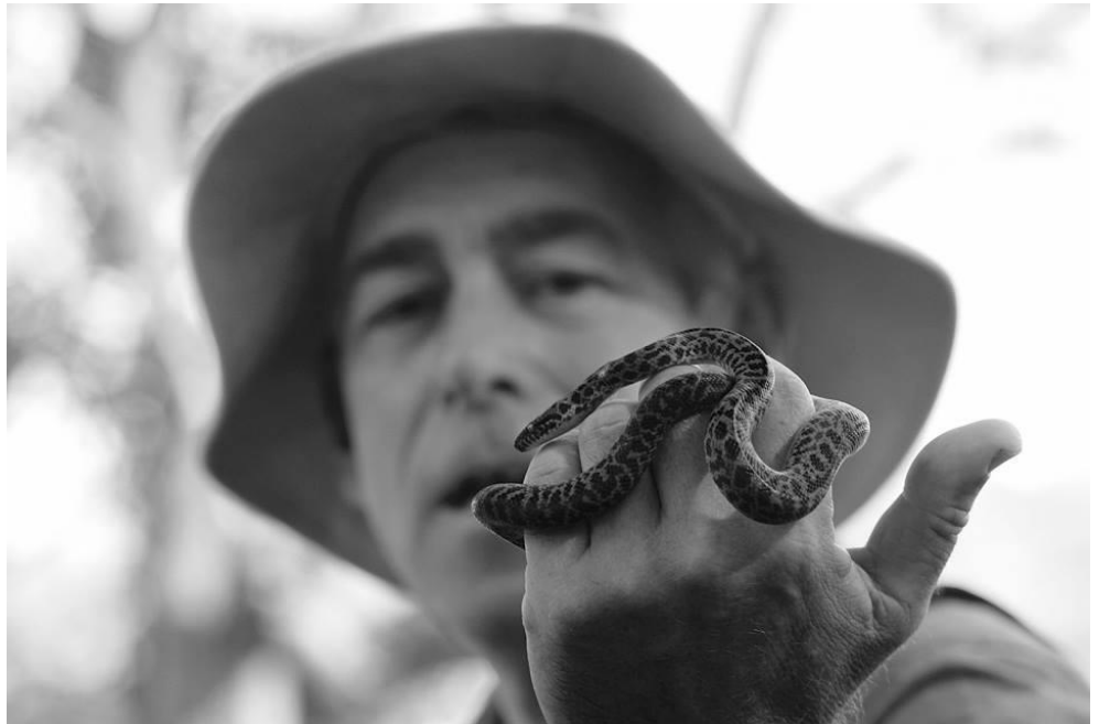
Figure 10: Survey leader with whip snake