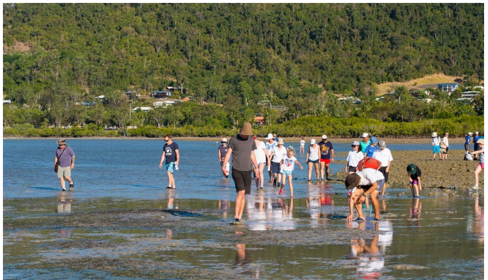
Figure 5: Rocky shore survey at ReefBlitz 2014

Over the course of the weekend, 23 biodiversity surveys and a beach clean-up were held for the general public. Additionally, a tailored schools program was held for three local schools and two PCYC youth groups. A total of 191 species were identified (from 656 observations) during the event.