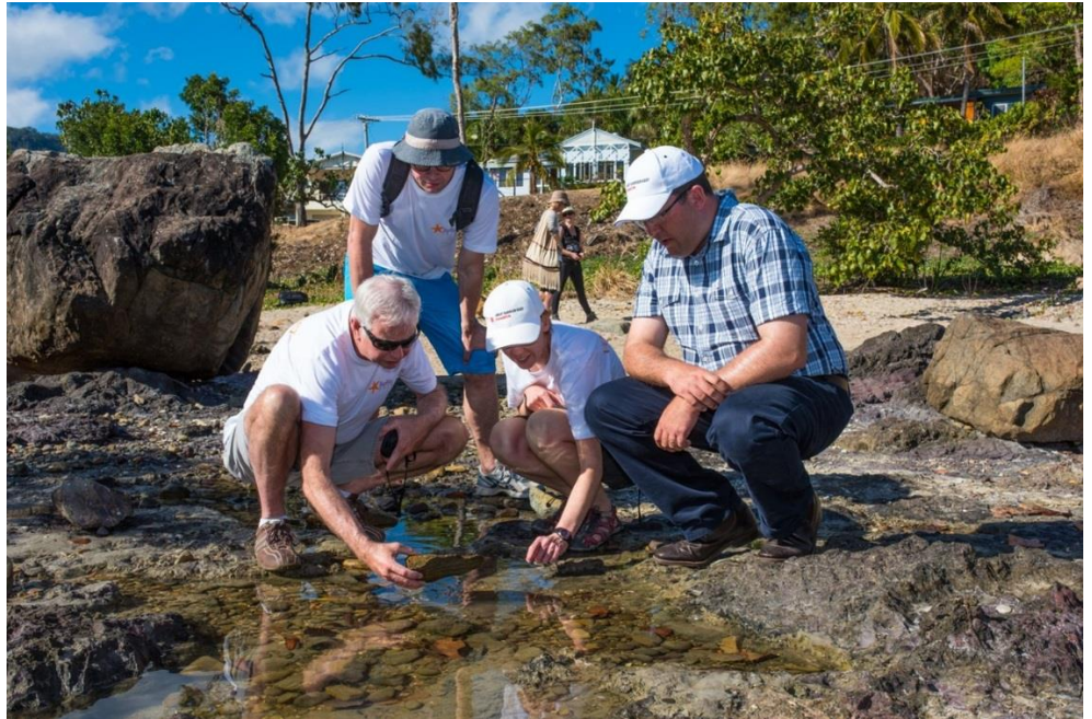
Figure 4: Tide pool survey

The event attracted 389 participants and about 35 volunteers and staff. Of these, 247 took part in the schools program, and 142 were participants from the broader community.