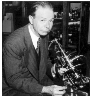
Dr Royal Rife