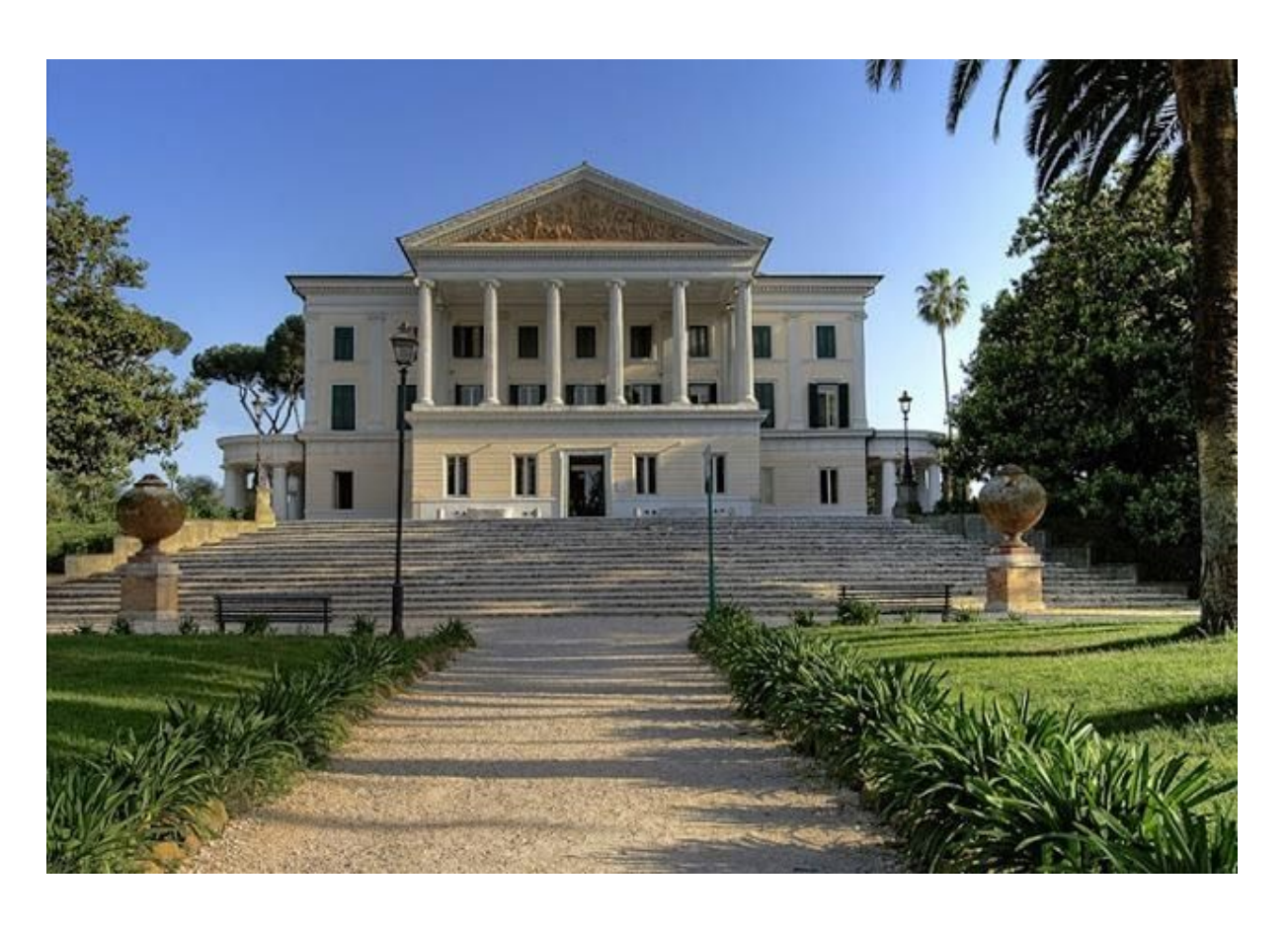
Torlonia Villa in Rome. The Torlonias are the Vatican's Treasurers.