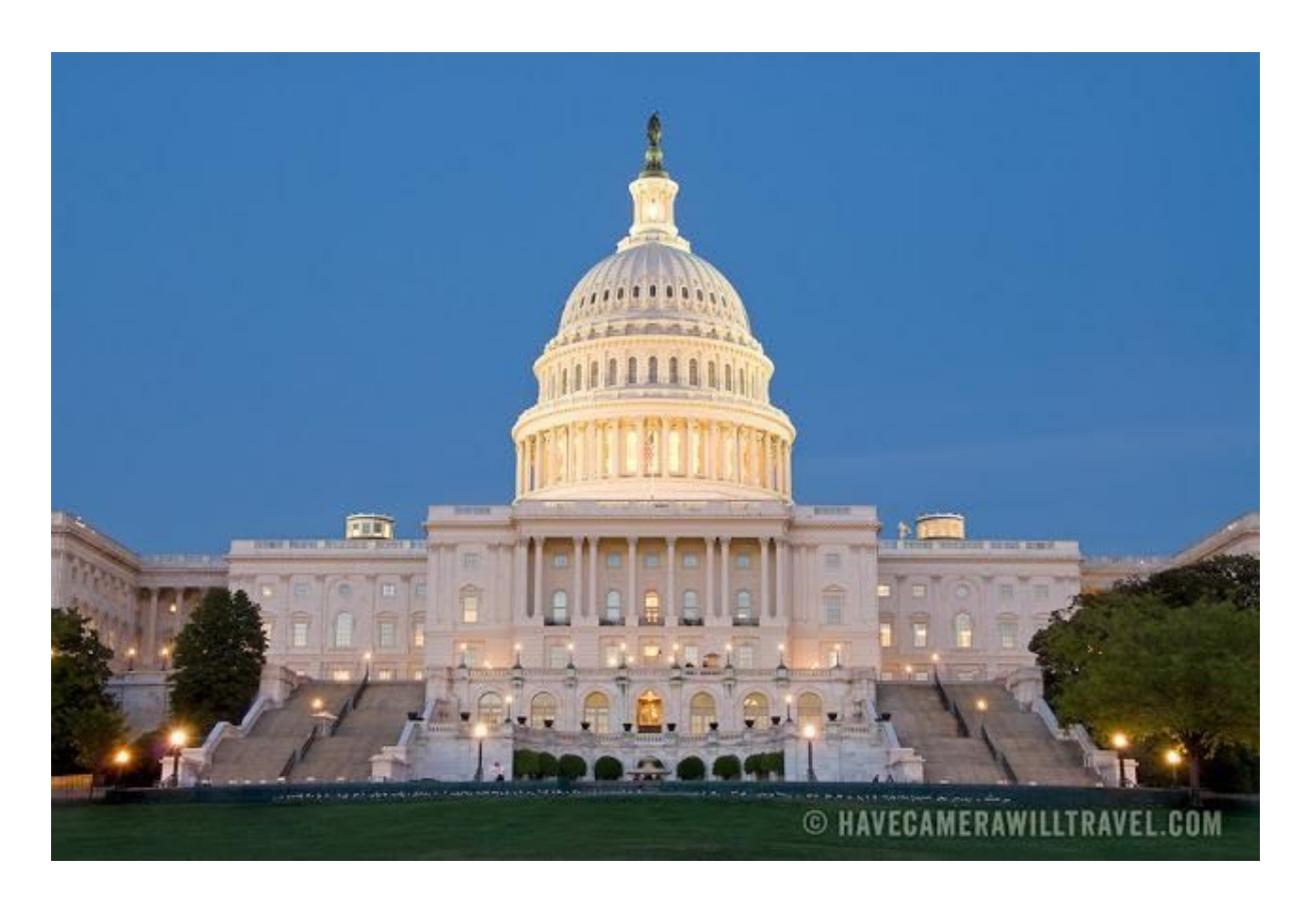
Capitol Hill in Washington DC is architecturally based on Saint Peter's Basilica.