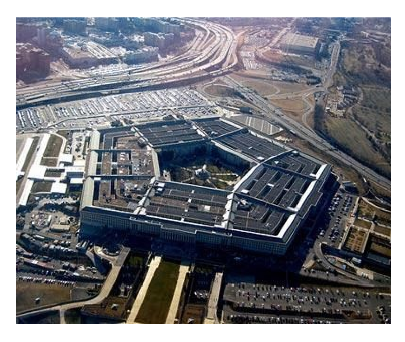
The US Pentagon is designed as a pentagon to symbolize the modern Farnese Villa. Jesuits of Georgetown dominate leadership positions in the CIA and US Military.