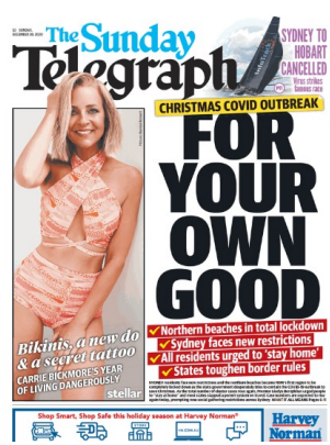
New South Wales and Victoria: Similar challenges. Different narratives.