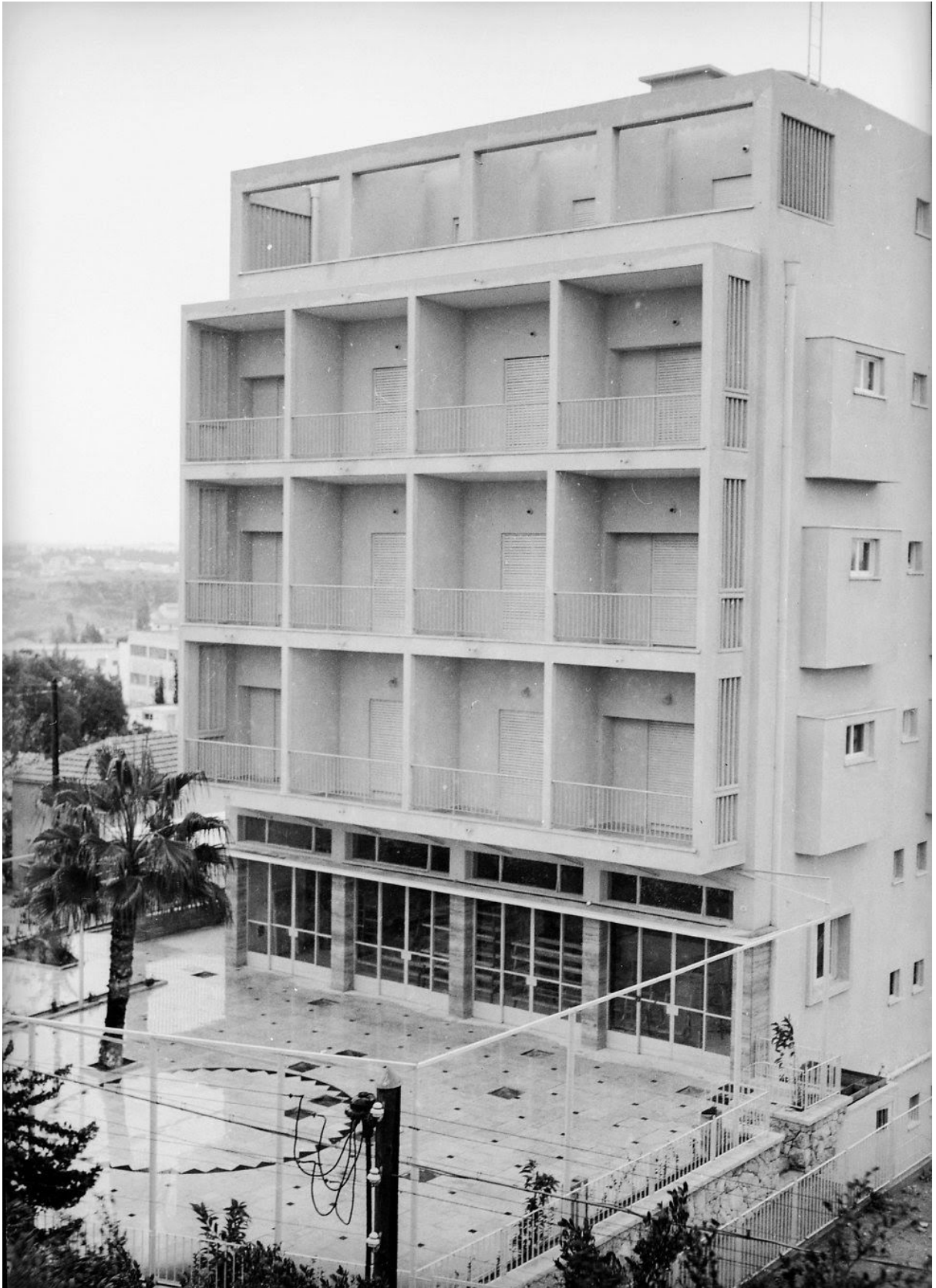
The Soviet embassy in Ramat Gan