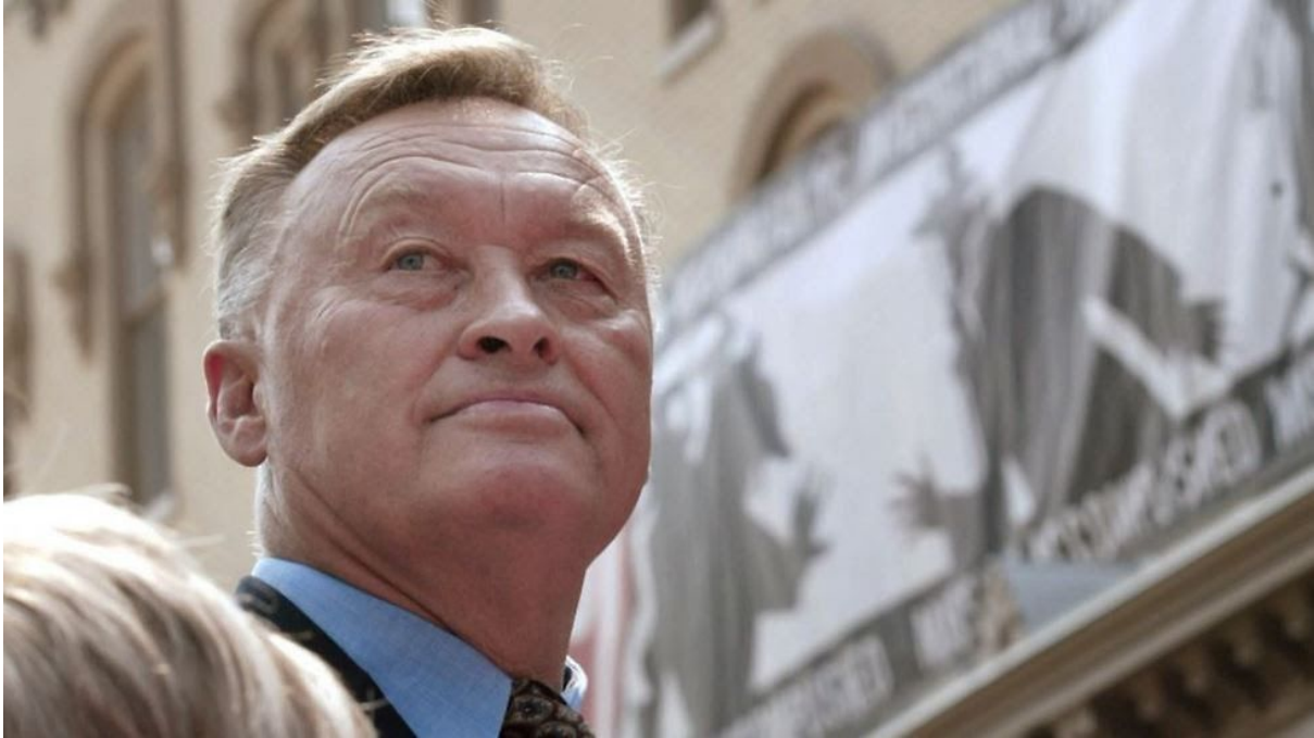
Former KGB General Oleg Kalugin