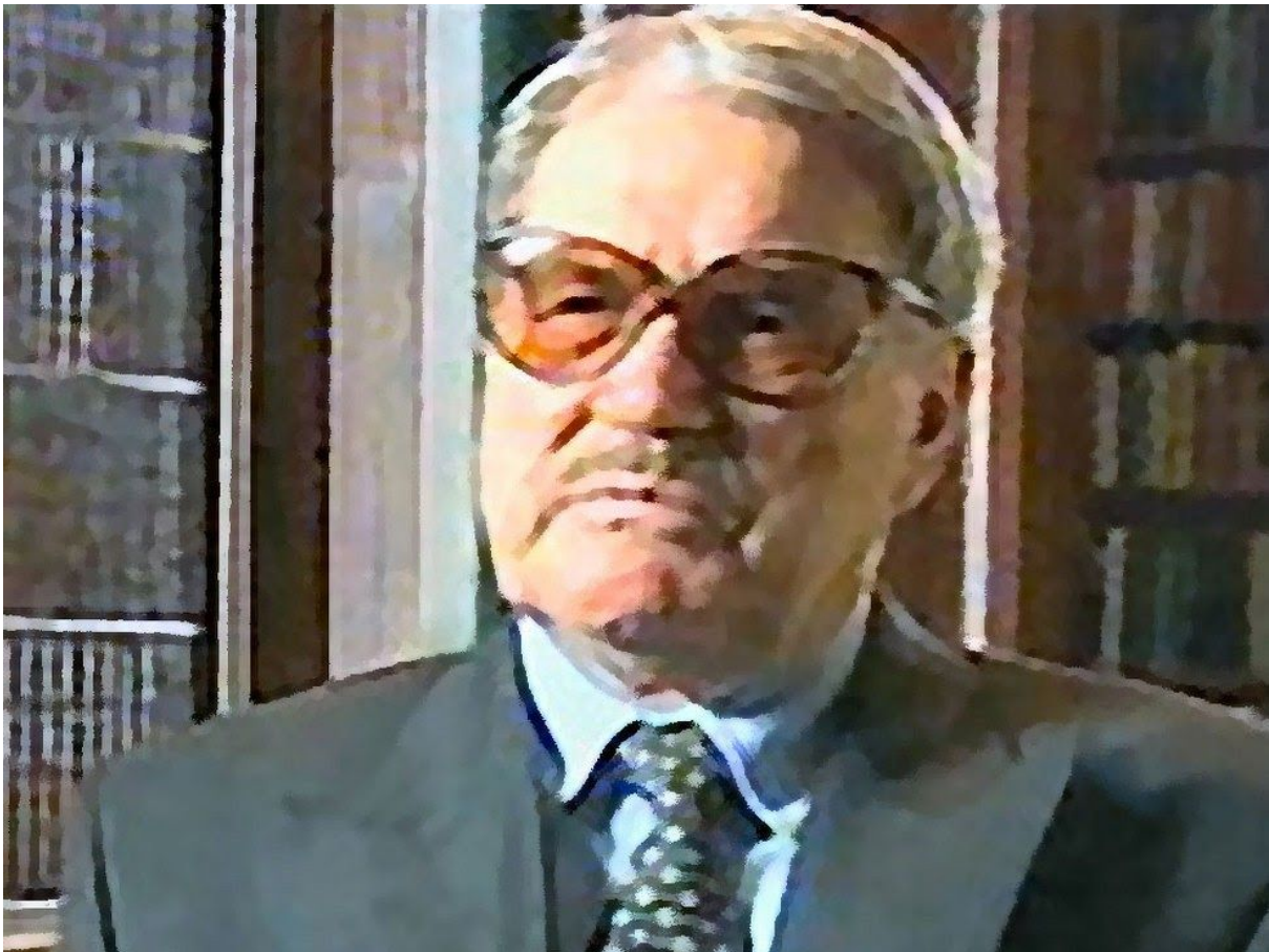
Vasili Mitrokhin after defecting to the West

In Soviet intelligence lingo, "illegals" are the organization's elite, like the "fighters" of the Mossad's Caesarea division. The "illegals" underwent exhaustive training, which included learning foreign languages, guerrilla warfare, undercover activity and additional intelligence training. At the end of their training, they underwent a special ceremony, which was performed for each agent separately for compartmentalization purposes. The highlight of the ceremony was a melodramatic oath, in which the trainee declared, "As a worthy son of the homeland, I would rather perish than betray the secrets entrusted to me... With every heartbeat, with every day that passes, I swear to serve the Party, the Homeland and the Soviet people."