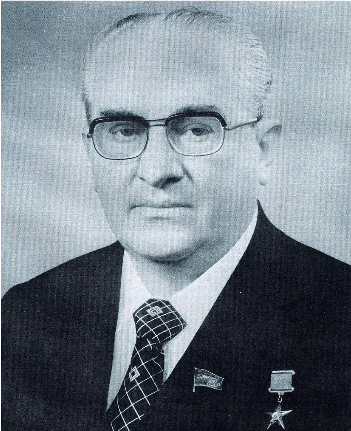
Former KGB head Yuri Andropov.

The operation file describes the selected "illegals": Codenames "Karsky," "Patriya," "Run" and "Yoris," who posed, respectively, as citizens of Canada, Spain, Mexico and Finland. They were all senior KGB officers, and they each had a long and detailed cover story tailor-made for them to explain their stay in Israel. In 1971, the four toured the country to