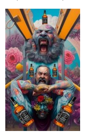
File: <a href="mailto:dbe2ee839c29937....jpg">dbe2ee839c29937....jpg</a> (508.19 KB,1080x1764,30:49,Picsart_23_03_02_15_38_31_....jpg)