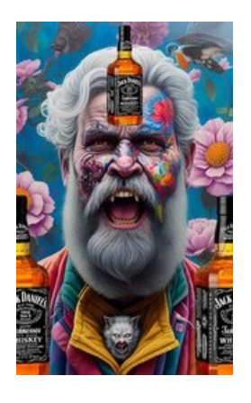
File: <u>15460013caf5d89···.jpg</u> (519.65

KB,1080x1764,30:49,Picsart_23_03_02_15_42_22_....jpg)