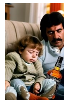
File: 338e9a07d3f5746\cdots.jpg (301.17

KB,1080x1764,30:49,Picsart_23_03_09_11_16_18_....jpg)