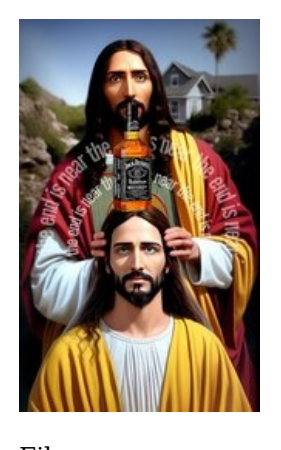
File: <u>063aacb65a44d1e···.jpg</u> (268.04

KB, 1080x1764, 30:49, Picsart\_23\_03\_09\_11\_30\_31\_....jpg)