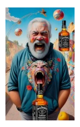
File: 7e4fb8165e09f7b...jpg (569.66 KB,1080x1764,30:49,Picsart_23_03_02_15_41_31_....jpg)

KB,1080x1764,30:49,Picsart_23_03_02_15_42_22_....jpg)