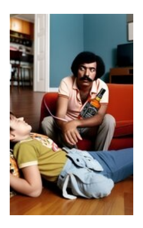
File: <u>09e75437c8df378....jpg</u> (387.85

KB,1080x1764,30:49,Picsart_23_03_09_11_16_18_....jpg)