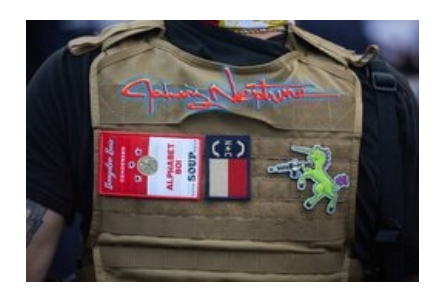
File: <u>18ddcde17e1d845....jpg</u> (66.58 KB,474x632,3:4,Maskhole.jpg)