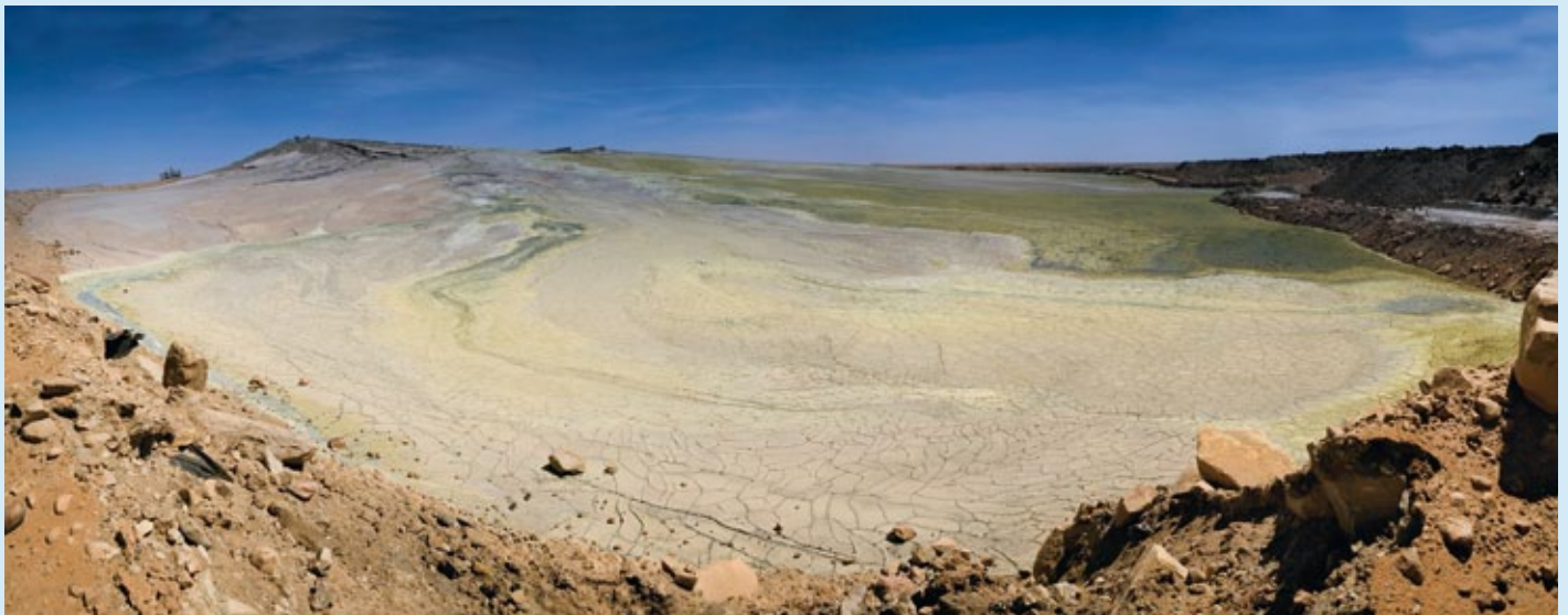
▲ Mountain of uranium tailings in Niger

over 40 years. 8 AREVA plans to open a third uranium mine – Africa’s largest – in Niger in 2015. 9