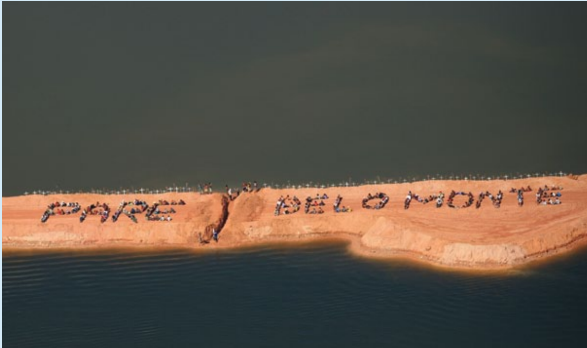
◀ Protest against Belo Monte Dam in Brazil

smoke that endangers worker and public health in the region. The company has refused to acknowledge any responsibility for health problems linked to their operation. 12