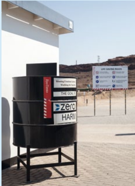
▶ Entrance of the Rössing Uranium Mine in Namibia.