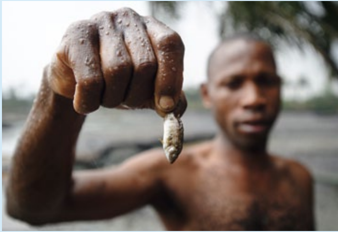
◀ Fisherman showing effect of oil pollution in local creek.