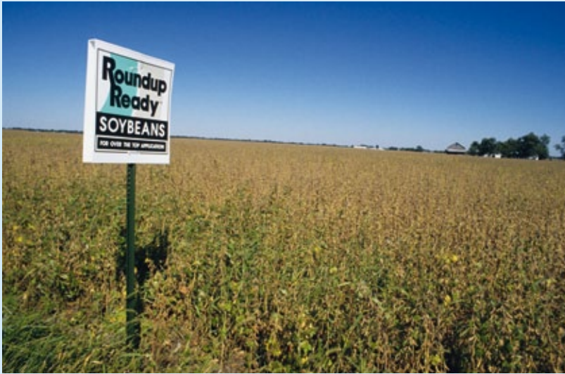
▲ Sign 'Round up ready soya beans' in field of genetically engineered soybeans.

contaminating a community for violating regulations that banned spraying pesticides near residential areas. 8