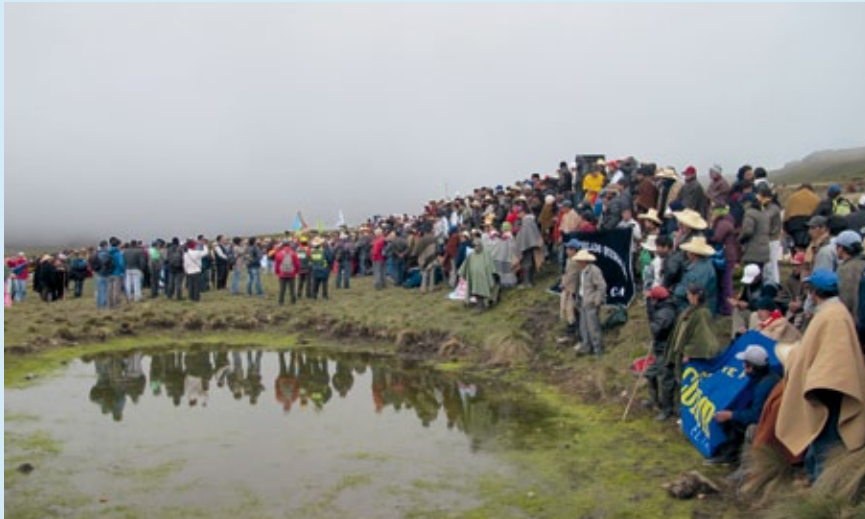
◀ Mass protest in Cajamarca, rally at mountain lake, May 31, 2012.