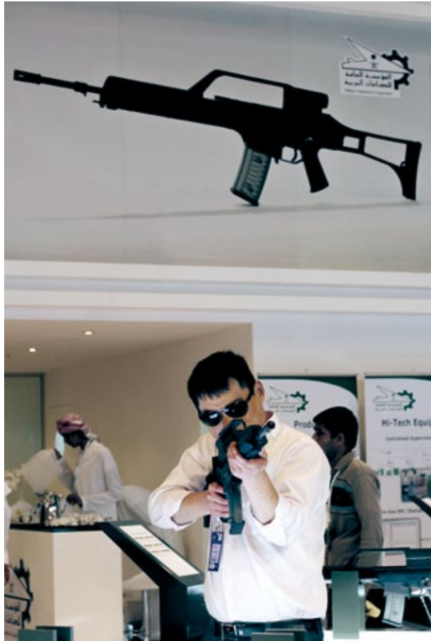
▲ German weapons to the front: IDEX 2013 booth of the Saudi Arabian company MIC which produces and sells German G 36 rifles under license from Heckler&Koch. German exports of small arms have more than doubled compared to the year 2011, in which 55% of the small arms export licenses were issued to non-NATO countries.