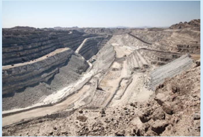
▲ Rössing Uranium Mine pit in Namibia

Dutch Shell case, which limited the reach of U.S. law in overseas human rights cases. 12