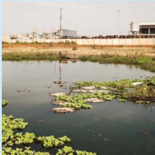
◀ Ikandilo water source next to the Buzwagi mine.

plan to the Chilean regulatory authorities to complete the water management system by 2014. 8