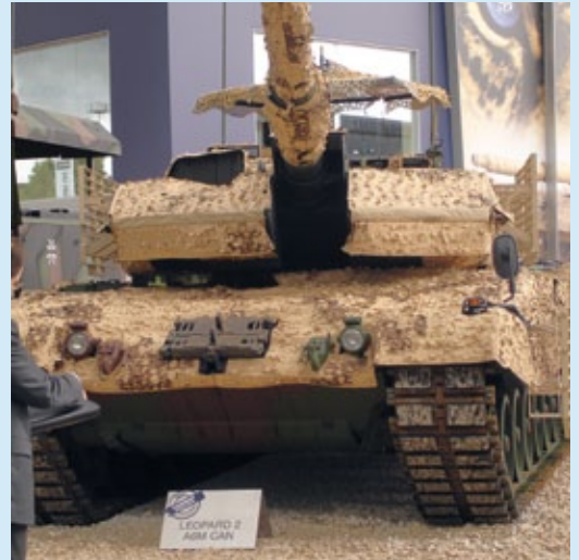
▶ Leopard 2 tank.

Ammunition” series, which includes insensitive munition (IM), high explosive (HE), conventional HE, screening smoke, illumination, infrared illumination, and many other projectiles. 7 Sources like the Jane’s Ammunition Handbook indicate that the 155mm Assegai family includes cluster munitions that have been banned by the Convention on Cluster Munitions. 8 Amnesty International claims that Saudi Arabian security forces commit frequent human rights violations, which include the use of excessive force against protesters, and the ill-treatment and torture of prisoners and detainees. 9