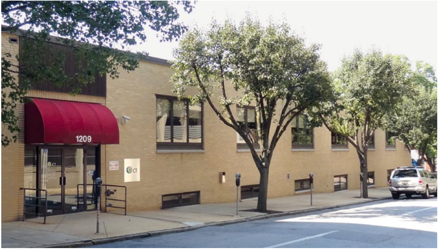
▲ CT Corporation office, 1209 North Orange Street, Wilmington, DE 19801-1120. It is home to over 6,500 corporations, and more than 200,000 businesses hold addresses at the location.

Vehicles (SPVs) are also popular. SPVs are temporary legal entities, limited companies, or limited partnerships. Companies can use SPVs to transfer debt. Banks often use them to turn loans into tradable financial products. For example, a bank that puts mortgage loans into an SPV legally separates itself from the loans. The bank further removes itself from the risk of those loans by selling them to investors as mortgage-backed securities (financial products based on the repayments of mortgage loans). Investor's difficulty in judging the value and risk attached to these products became one of the main impetuses of the financial crisis by distancing mortgage payers from investor attitudes towards their supposedly stable, AAA-rated financial products.