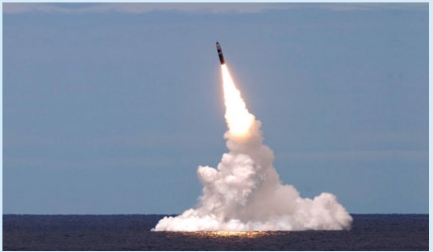
▲ Trident II D5 nuclear missile