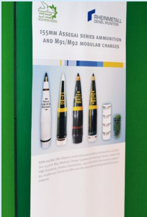
◀ Advertisement for the “Assegai Series” of artillery ammunition – a joint venture between Rheinmetall and the Saudi Arabian MIC (Military Industrial Cooperation) at the IDEX 2013 weapons exhibition in Abu Dhabi.