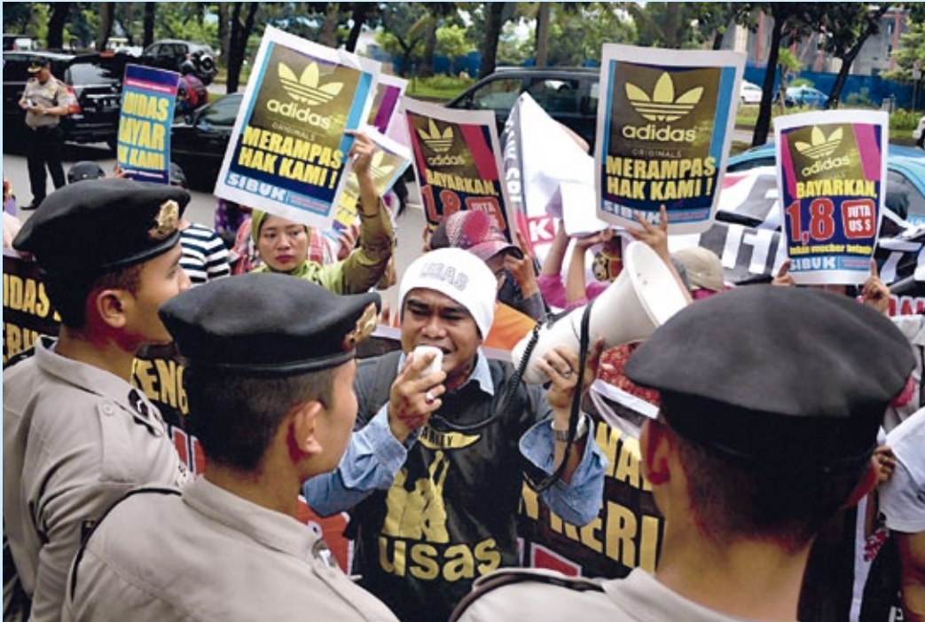
▲ PT Kizone Workers Action in Jakarta, 1. April 2013