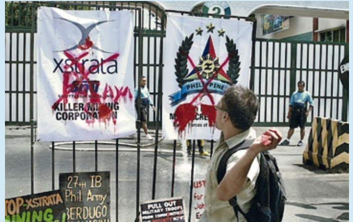
► Protest against the Capion massacre.

metals. 12 People believe that this contamination is linked to a recent increase in farm animal deformities. 13 Multiple studies by private and state entities found elevated levels of contaminants including aluminum, arsenic, copper, iron, lithium, and manganese in water and soil samples. 14 A study conducted by Peruvian state authorities that included 12,500 samples concluded that 2.2% of the samples were severely contaminated and 52.71% contained at least one parameter that exceeded official thresholds. In response to these findings, Xstrata cited the “natural background mineralization present in the region.” 15 Espinar’s mayor, Oscar Mollohuanca believes that the Tintaya mine is responsible for this contamination. 16 Anti-mine protests in May/June 2012 resulted in two deaths and multiple injuries. Mayor Mollohuanca was