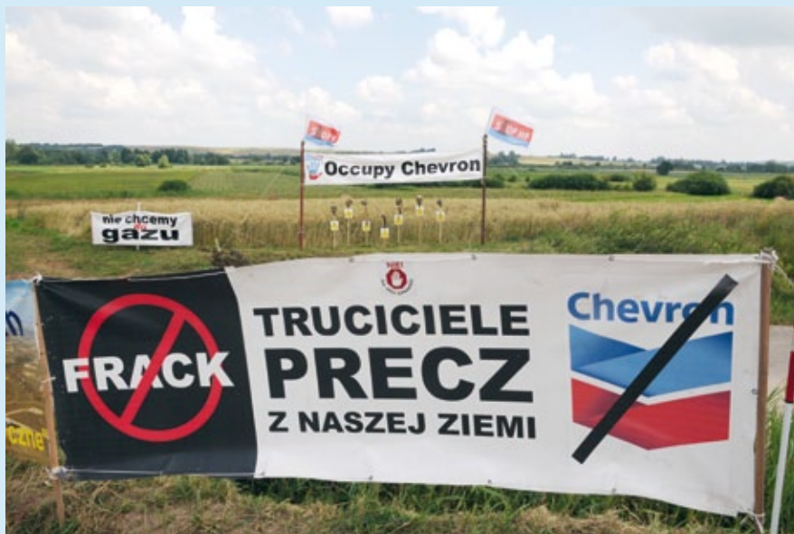
Protest against fracking. © Andrzej Bąk