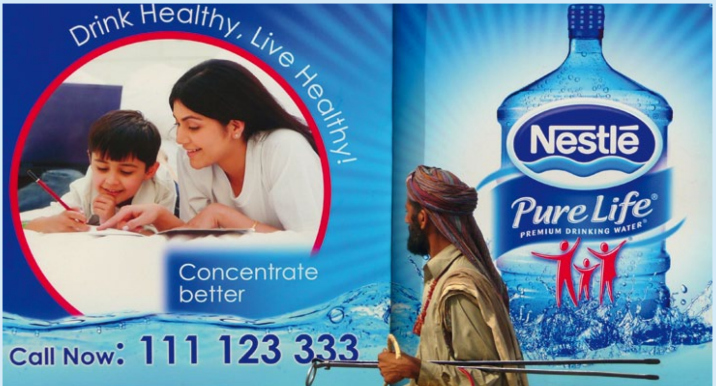
▲ Advertisement for Nestlé's Pure Life