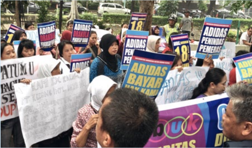
PT Kizone Workers Action in Jakarta, 1. April 2013

the dispute in April 2013 when they announced that they would pay severance to 2,700 Indonesian workers. 8