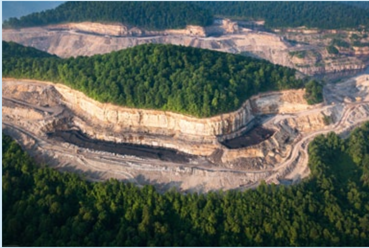
◀ Mountaintop removal in the Appalachian Mountains