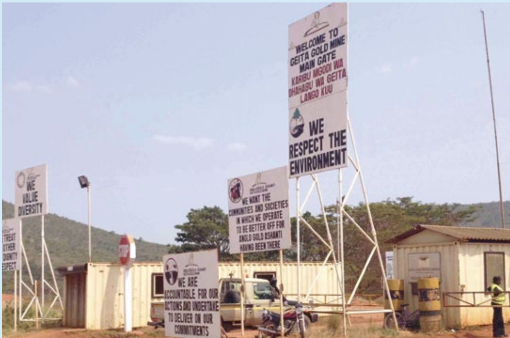
◀ AngloGold Ashanti, main entrance to the Geita Gold Mine.