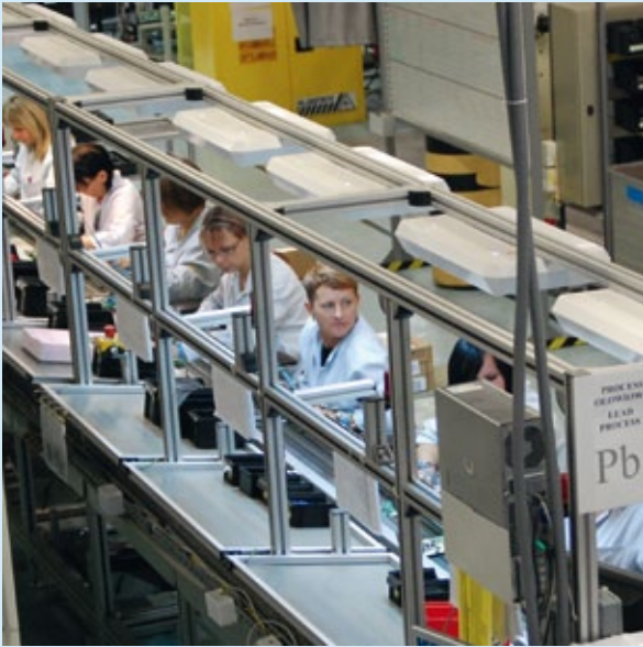
◀ Production line at Jabil Circuit Poland Sp. z o.o. in Kwidzyn