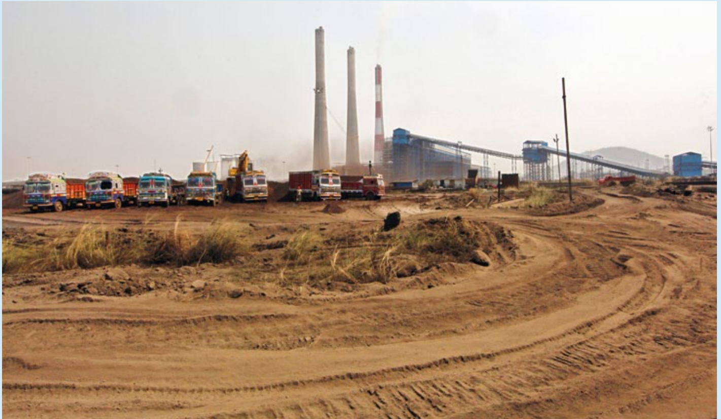
▲ A general view of the Jindal Power and Steel Ltd. complex is pictured at Nisha village in the eastern Indian state of Orissa March 27, 2012. Ten years after announcing the project, Jindal Power and Steel is still waiting to start digging for coal to fuel its $3.1 billion steel and power complex in Orissa. Picture taken March 27, 2012.

members from coming within the mine’s vicinity. There are several reports of security guards violently assaulting community members that pass through the gates on their way to their houses. 8