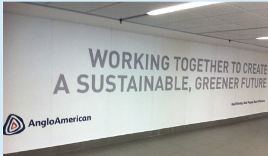
◀ Anglo American advertisement welcoming the 2011 UN Climate Change Conference attendees to South Africa.