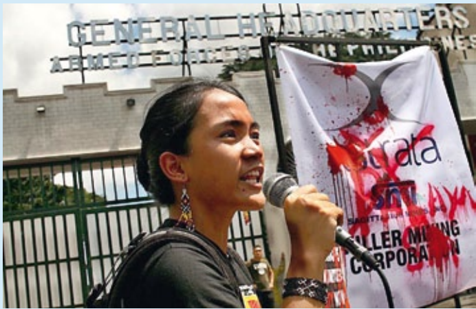
▲ Protest against the Capion massacre.