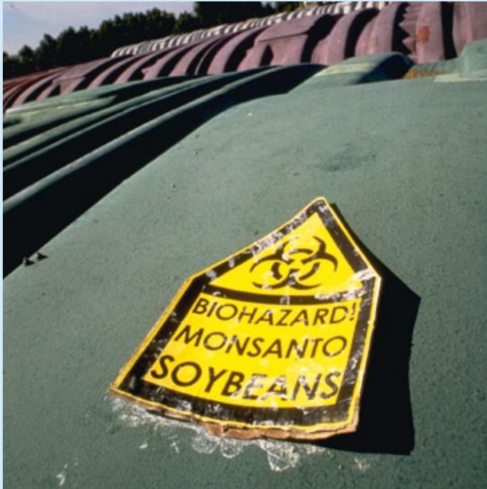
Greenpeace Action against GE soya beans from Monsanto in Louisiana.