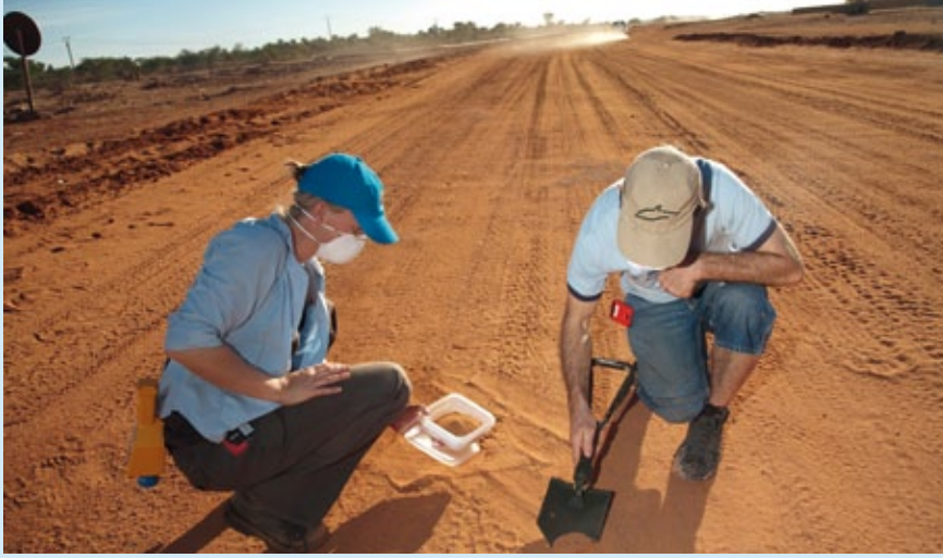
▲ ▶ Radiation measurements in Akokan, Niger