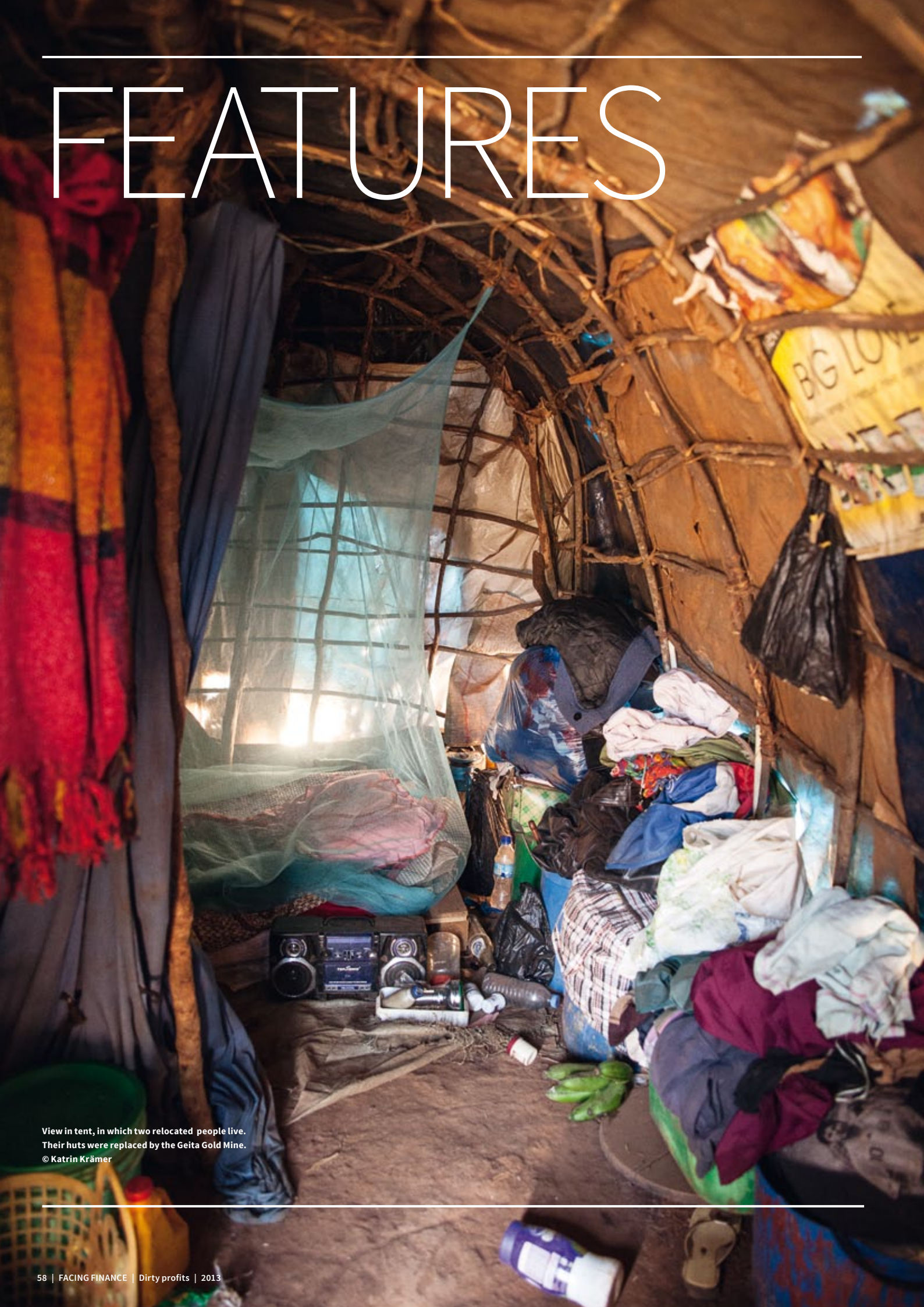
View in tent, in which two relocated people live. Their huts were replaced by the Geita Gold Mine.