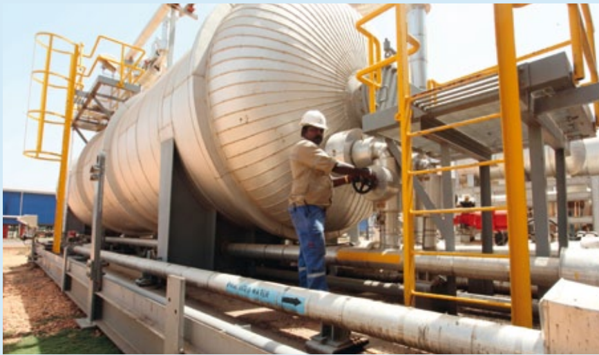
◀ An oil worker turns a spigot at an oil processing facility in Palouge oil field in Upper Nile state February 21, 2012, following a dispute with Sudan over transit fees. South Sudan will refuse to do any business in the future with oil trader Trafigura if it is proven that the firm bought oil from neighbouring Sudan in the knowledge that the cargo was seized southern crude, its oil minister told Reuters.