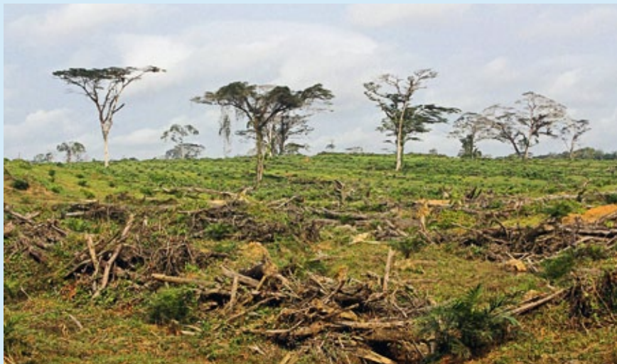
◀ New palm oil plantation at the Golden Veroleum concession in Sinoe County, Liberia