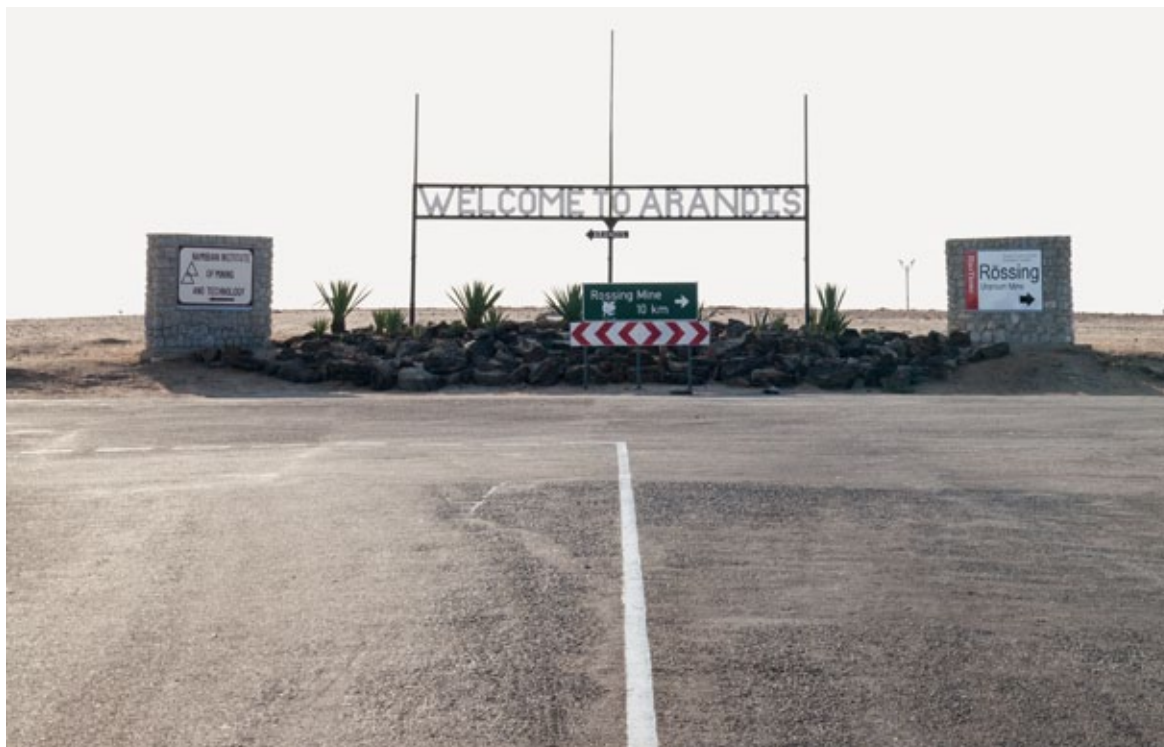
◀ Entrance to the Namibian community of Arandis, established for Rössing employees.

T his report exposes the financial ties between 19 European financial institutions (FIs) and 26 multinational companies, spanning multiple sectors, notorious for their poor environmental and human rights records. The purpose of this report is to raise awareness and to call on FIs to establish and/or improve policies governing financial services that are linked to violations of internationally accepted norms and standards.