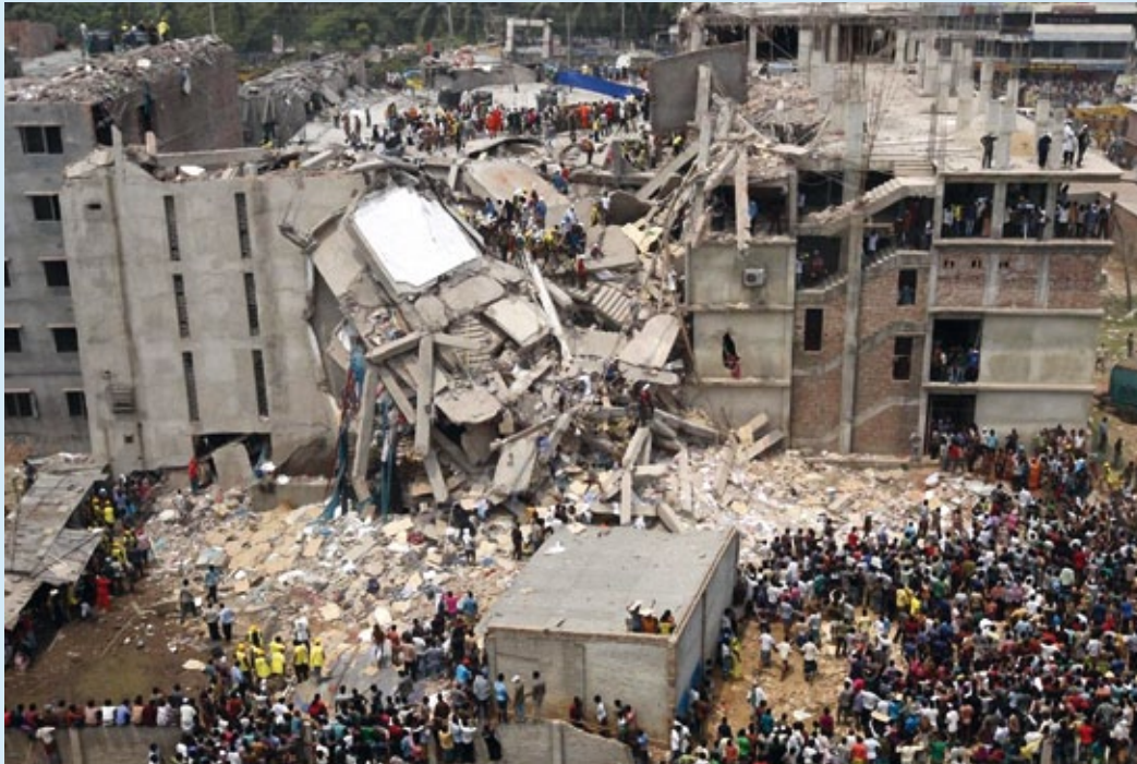
▲ Dhaka Savar Building Collapse.