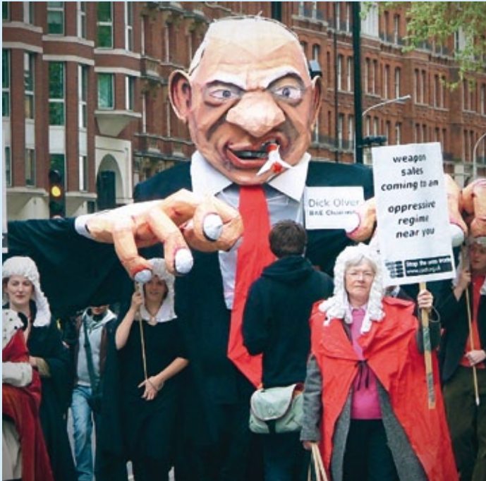
◀ Civil society protest against BAE Systems.

quently fined BAE $79 million in May 2011 for violations of the Arms Export Control Act. BAE only narrowly escaped debarment from U.S. government contracts. 12