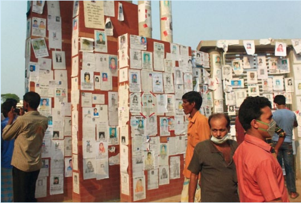
▲ Savar building collapse – missing board.

under deplorable conditions for the minimum wage, $38 a month. Safety issues pose a constant threat to Bangladeshi garment industry workers. Fires and machinery explosions claim scores of lives every year (e.g. the Tazreen garment factory fire in November 2012 killing 112 people). 9 In the last 11 years (excluding the Rana Plaza collapse), poor safety standards accounted for 730 deaths. 10