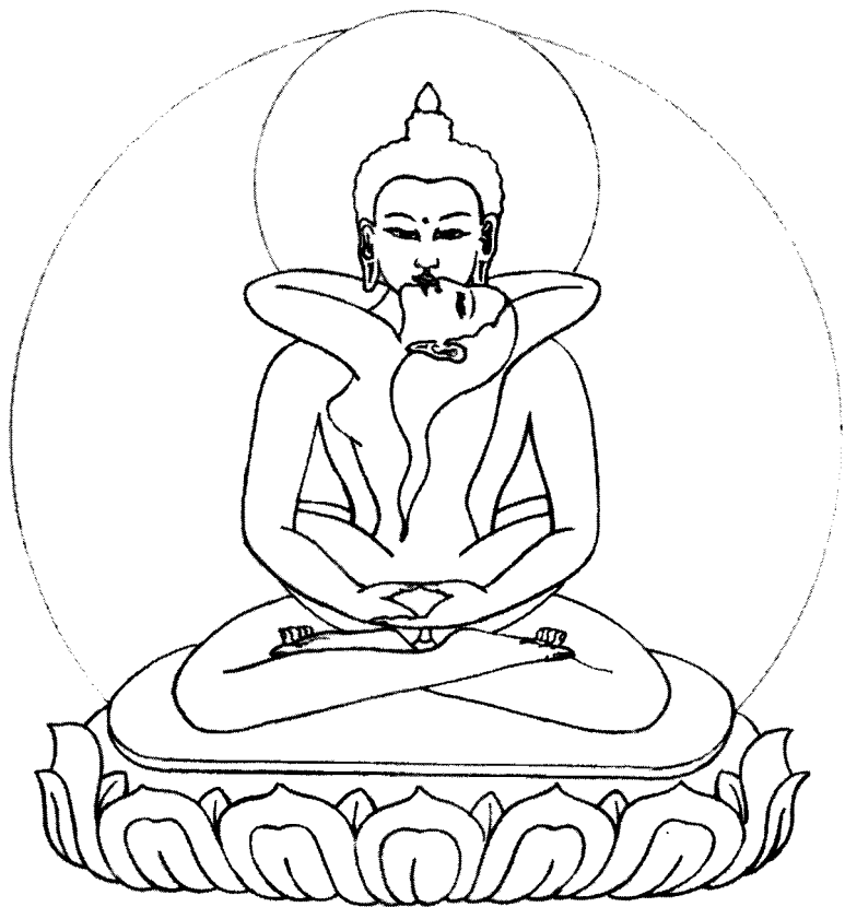
Samantabhadra and Samantabhadri