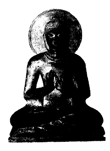
This is not a Buddha Homage to René Magrite

From the very beginning of beginningless samsara we have been engaged in the activity of ignorance and we have accumulated the five poisons and done many, many things to hurt and harm others. So it is predictable that we will continue to do things that upset and hurt other people. But the task in dzogchen is to go deeply into open awareness and to develop clarity, and responsiveness, an energetic engagement with the world that reveals itself as it is. From time to time we develop fantasies about people, loving fantasies on the basis of which we say things to them, giving them reasons to believe in us or hope for things and then our mind changes and we betray the shared fantasy, the folie a deux. There are no self-existing objects. Projecting onto others is projecting onto projections. Bearing that in mind keeps things light so that situations, even if painful, can be resolved. The answer lies in us, not in the other. Relaxing, keeping loose, light and responsive Supports our entering instant presence in the midst of life's complexity.