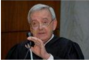
Special master Raymond J. Dearie — a former chief