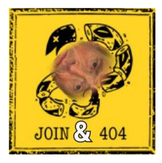
File: <u>46003f9e9bc839f….jpg</u> (177.79 KB, 768x935, 768:935, Here_to_Help.jpg)

File: <u>0c087f135bcc2f9….png</u> (212.41 KB, 666x666, 1:1, Join_AND_404_JN.png)