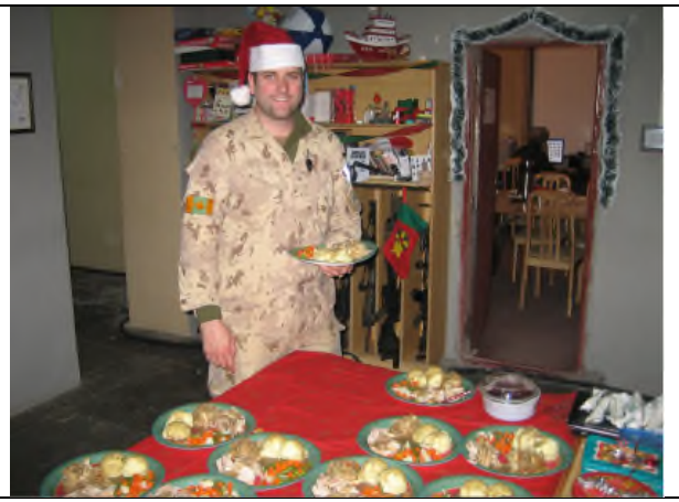
Christmas dinner at the JCC in Kandahar City.