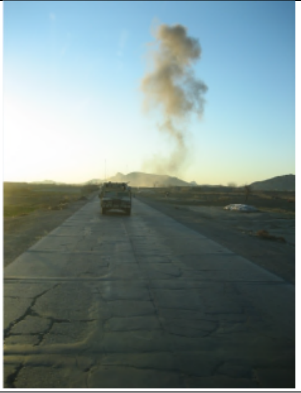
Cloud of smoke caused by IED that exploded near end of convoy on the way back to KAF.