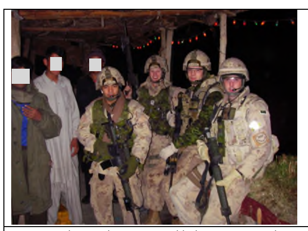
Foot patrol visits the compound belonging to a militia loyal to the governor.