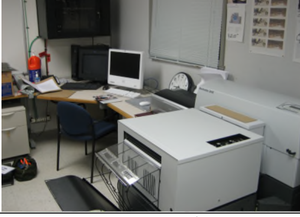
Printing equipment at PSTC of the type that was planned to be deployed to KAF.