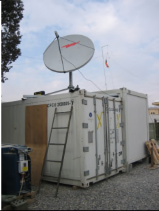
Container of equipment received and satellite receiver set up in yard of JCC.