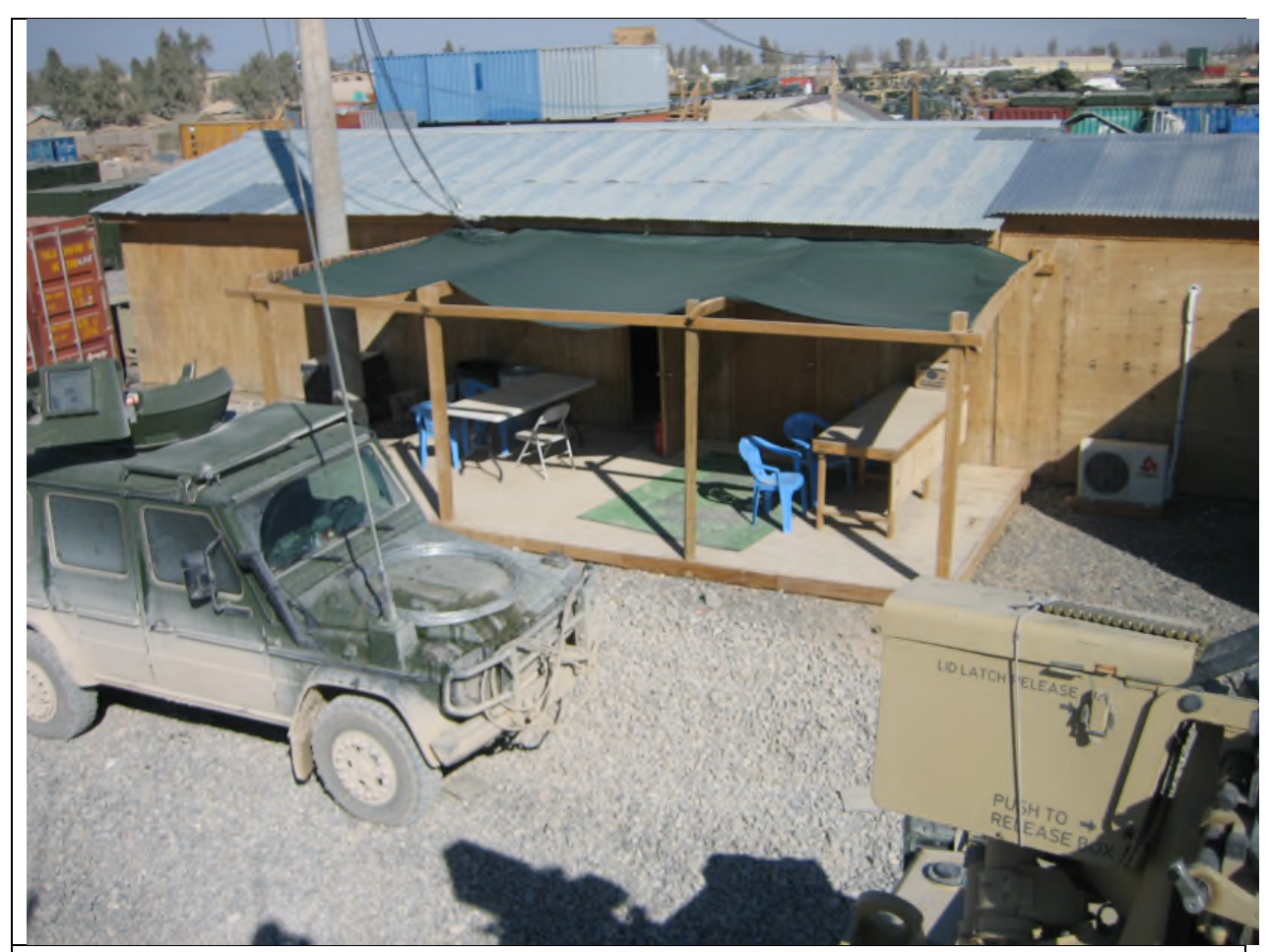
ISAF PSYOP offices at Kandahar Air Field.

2005 and 2006 – Technical assistance visits regarding Psychological Operations