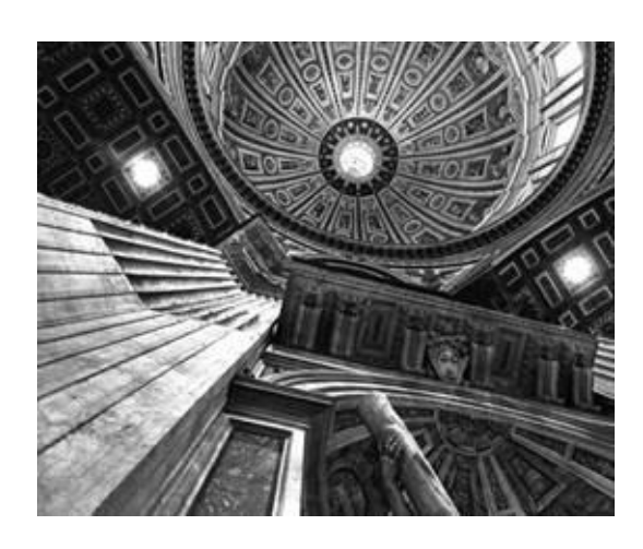
CHRISTIAN / GNOSTIC CHRISTIAN SOURCES