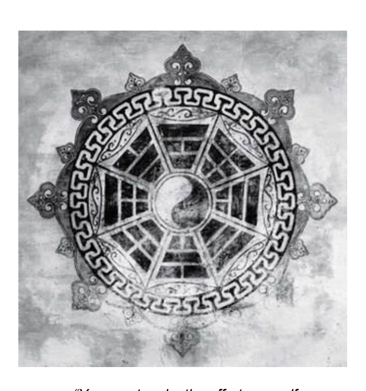
"You must make the effort yourself.