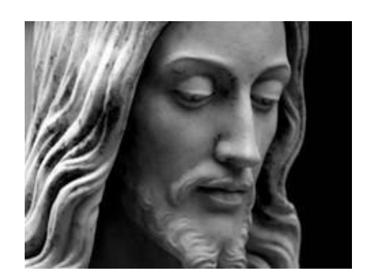
Jesus: Original man had one original mind. It was unified. Dialogue of the Savior

The reality is that our minds are completely out of control. The human mind has often been compared to a hyper-active chattering monkey who refuses to stop moving or shut up. Anyone who has ever tried to meditate knows just how appropriate that metaphor is. Still, it would appear that we have no choice but to train our mind as if it were a new puppy that hasn't been housebroken yet. We need to become the master of our mind, not its slave.