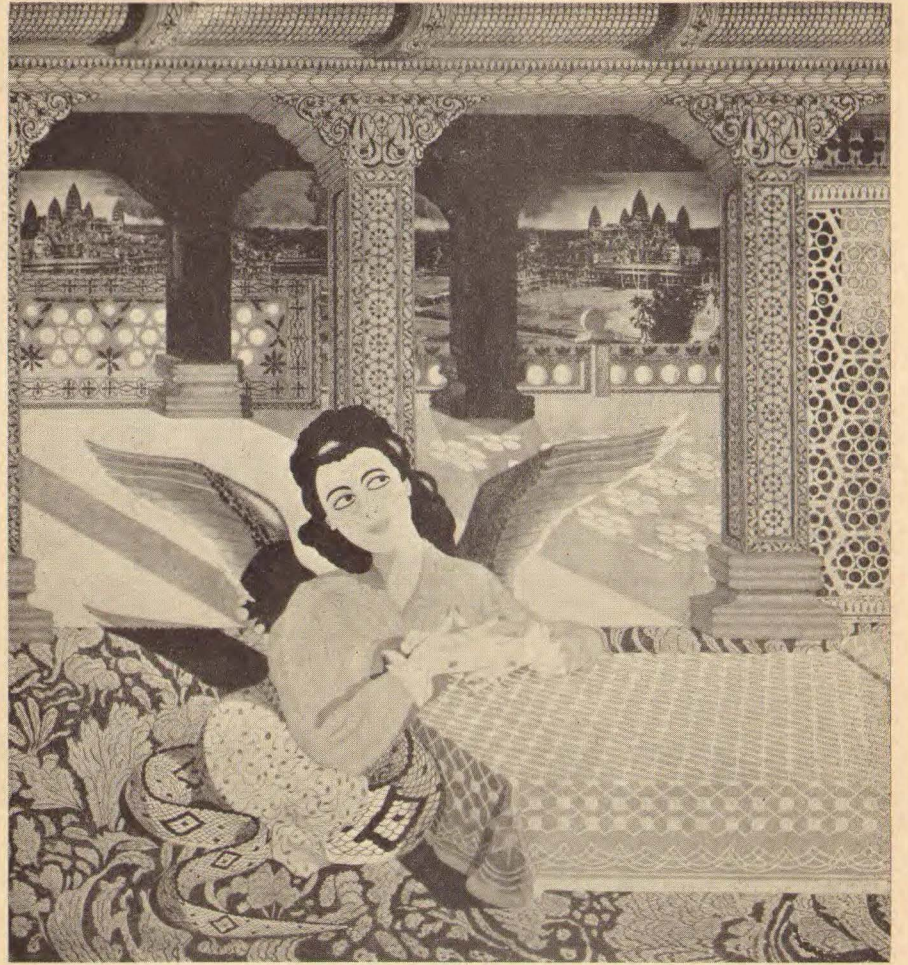
Kali, the Female of the Serpent System