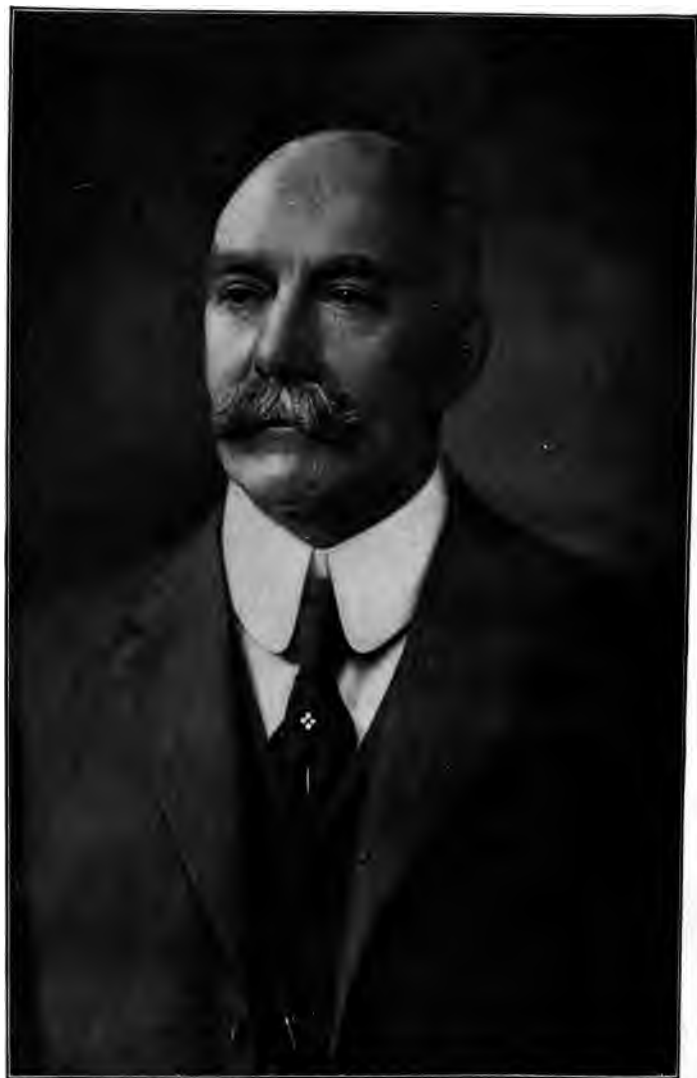
Orison S. Marden