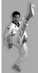
Roundhouse kick: upper body declines in relation to upraised kicking leg