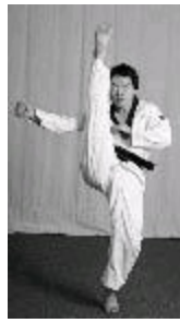
Front kick: slight upper body decline