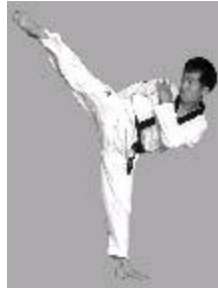
Side kick: upper body declines in relation to thrusting height of kicking leg