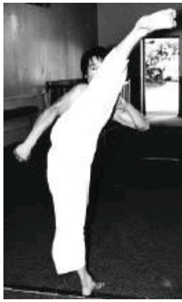
FRONT VIEW: roundhouse kick with the instep