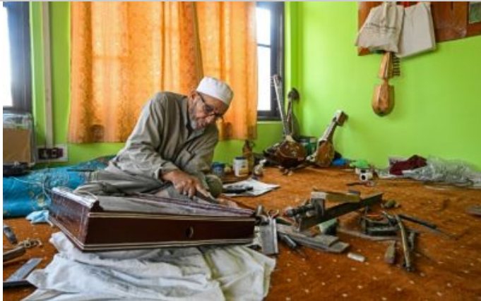
Strings Of Identity: Kashmir's Fading Music Endures