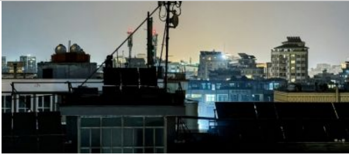
Taliban Shut Down Communications Across Afghanistan