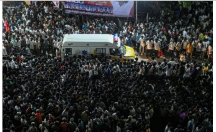
Indian Actor-politician's Aides Charged After Rally Stampede Kills 40