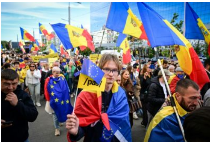
Moldovans Torn Between Pro-EU And Pro-Russia Vote In Tense Polls