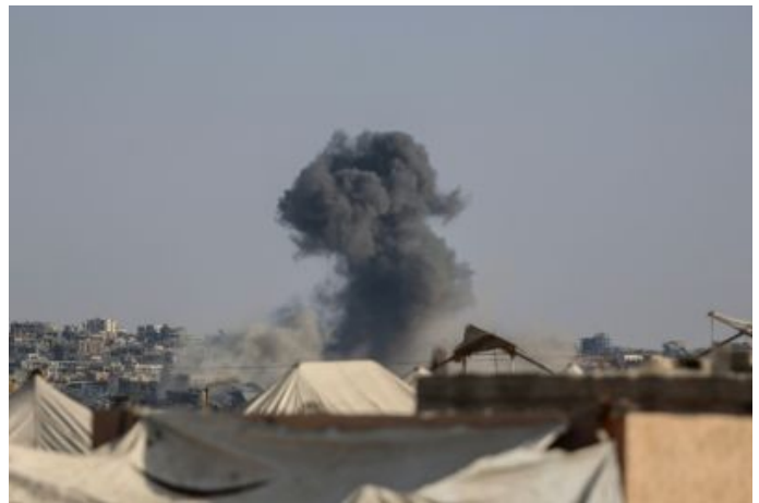
Muslim States Join EU Powers In Backing Trump Gaza Plan