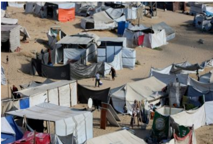
Gazans Say Trump's Peace Plan A 'Farce'