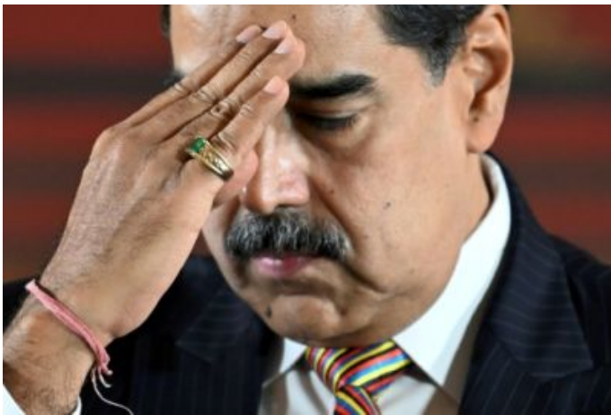
Venezuela's Maduro Slams YouTube Censorship, Claims More People Are Watching Him Now: 'Imperialist Fools'