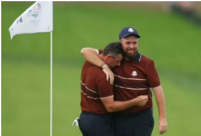
Europe Shrugs Off Intense Abuse To Reach Brink Of Ryder Cup Win