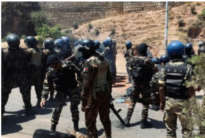
Madagascar Protests Reignite As Police Launch Tear Gas