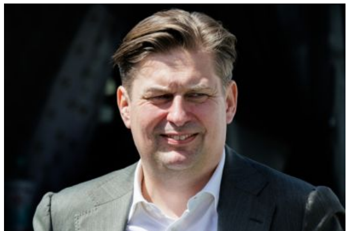
Far-right German MP's Ex-aide Faces Verdict In China Spy Case