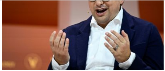
Anthropic Launches New AI Model, Touting Coding Supremacy