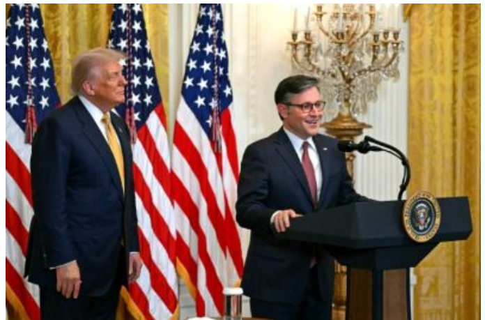
Trump Meets Democrats In Last-gasp Talks Before US Government Shutdown