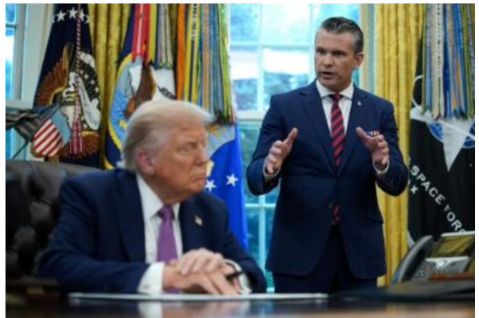
Trump To Address Rare Mass Meeting Of US Military Leaders