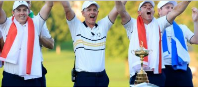
Europe Win Emotional Ryder Cup Triumph After US Fightback