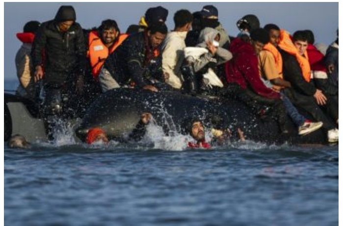
UK Plans Tougher Rules For Migrants Seeking To Stay In Country