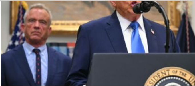
Internet Outrage Over Trump's AI Conspiracy Video