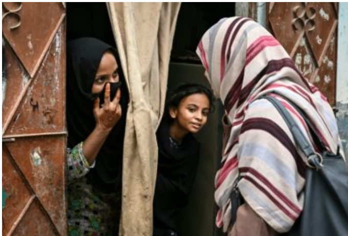
Pakistani Parents Rebuff HPV Vaccine Over Infertility Fears