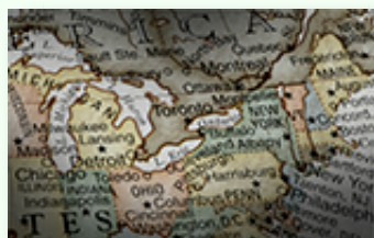
2016 Canada Border Tour