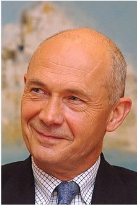
5th Director-General of the World Trade Organization

https://www.wto.org/english/thewto_e/dg_e/pl_e.htm