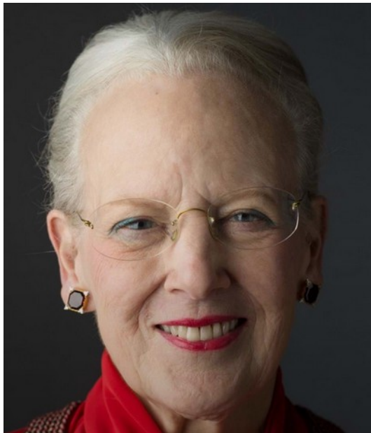
Margrethe Alexandrine Þórhildur Ingrid

https://www.kongehuset.dk/en/the-royal-family/hm-the-queen/#