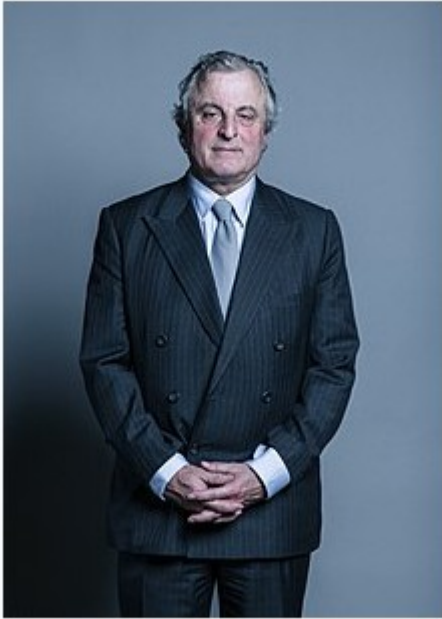
The Viscount Astor

https://nt.global.ssl.fastly.net/cliveden/documents/the-astor-family-tree.pdf