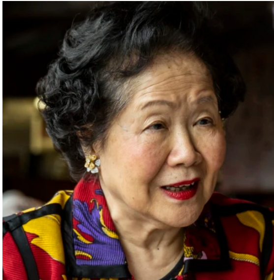
Anson Maria Elizabeth Chan Fang On Sang, GBM , GCMG .

CBE , JP (Chinese: 陳方安生; née Fang; born 17 January 1940) is a retired Hong Kong politician and civil servant who was the first ethnic Chinese and woman to serve as Chief Secretary , the second-highest position in both the British colonial government and the Hong Kong SAR government under the Chinese sovereignty from 1993 until she retired from the government in 2001, sparking speculations of her growing rift with Chief Executive Tung Chee-hwa https://www.afr.com/world/asia/iron-lady-anson-chan-fears-for-hong-kong-s-way-of-life-20191217-p53ktd