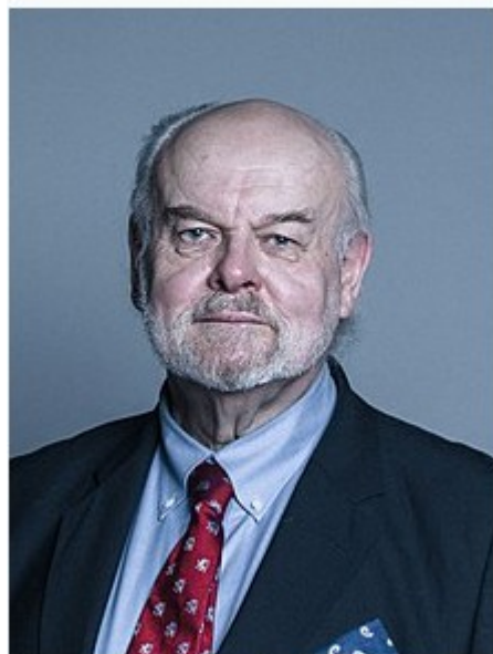
Official portrait, 2018

https://www.gresham.ac.uk/speakers/dr-richard-chartres