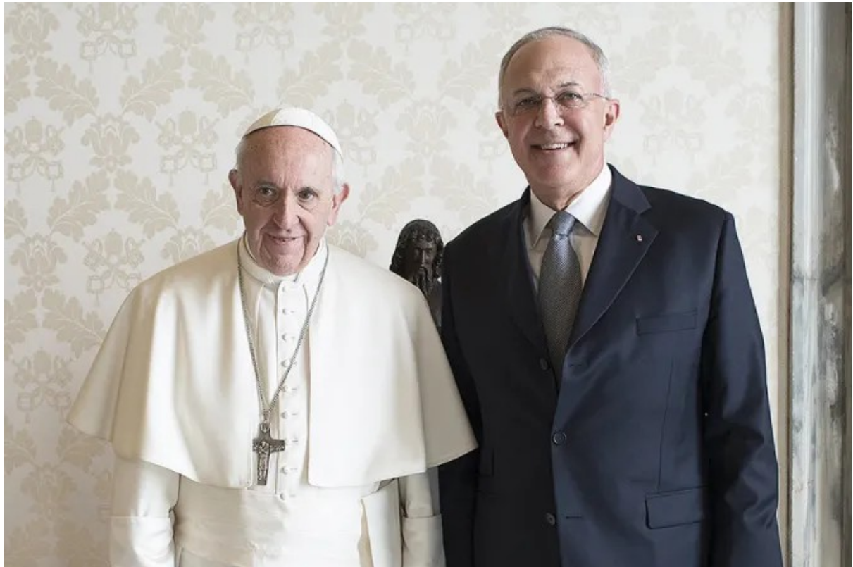
William Waldorf Astor III, 4th Viscount Astor