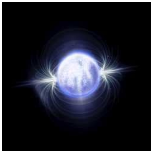
2MiB, 1899x1899, Alioth.png