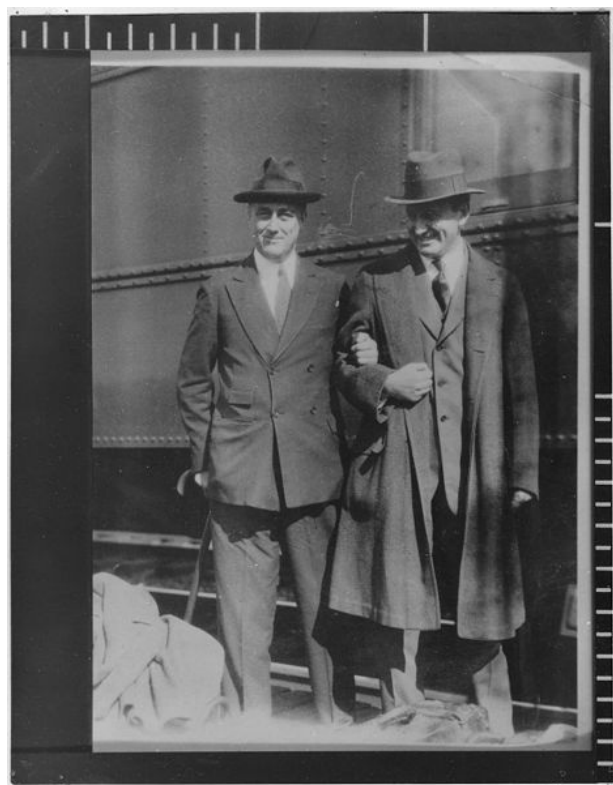
Franklin D. Roosevelt arm in arm with Henry Morgenthau Jr.

Before turning to FDR’s long and historic stint as president, I want to recall a question I raised in Part 1 of the present series: Was Roosevelt Jewish? Previously I noted that his fifth cousin Theodore claimed to be Jewish, according to former Michigan governor Chase Osborn. I have yet to find any independent confirmation of this assertion, though there seems to be no reason why Osborn would lie about such a thing. Both were good Republicans, after all. But more to the point, Osborn would have much to say about FDR, as I will explain momentarily.