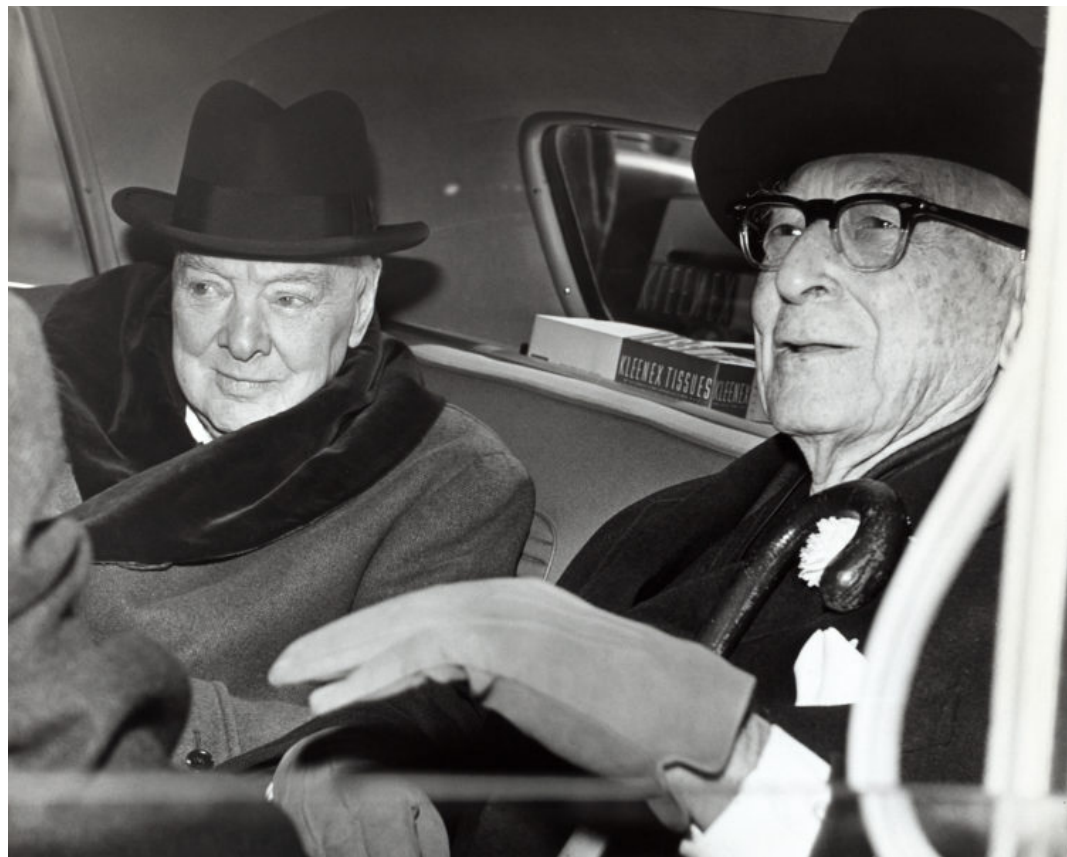
Winston Churchill and Bernard Baruch

link to source : https://nationalvanguard.org/2017/12/the-jewish-hand-in-the-world-wars-part-2/ http://archive.fo/msLow