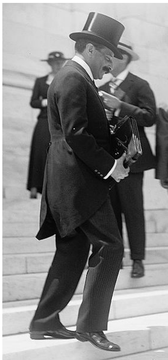
Jewish banker Paul Warburg (1868-1932) at the 1 st Pan-American Financial Conference, Washington D.C., May, 1915.

The second event occurred in 1912. Roosevelt had declined to run again in 1908, preferring to nominate his Secretary of War, William Taft—who proceeded to win handily. Taft, however, disappointed many Republicans, and there was a call to bring Roosevelt back. But the party would not oust a sitting president, and so Roosevelt decided to run on a third-party ticket. Hence the peculiar status of the 1912 election: it featured Taft running for reelection, Roosevelt running as a third-party candidate, and Woodrow Wilson running as a first-term Democrat. As the history books like to say, we had a former president and a sitting president running against a future president. Wilson, as we know, would win this race, and go on to serve two consecutive terms—covering the lead-up, duration, and aftermath of World War I.