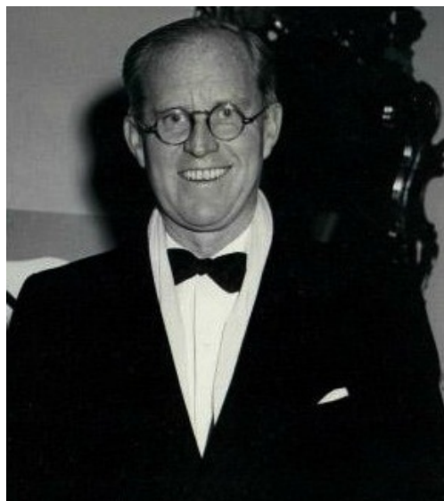
Photo of Joseph Kennedy in New York, 1 November 1940. At the time, Kennedy was the United States Ambassador to Great Britain.

Around that same time, the American ambassador to Great Britain began to cause a stir. He was a member of the Boston-area Irish Catholic set, a successful businessman...and father of a future president. Joseph Kennedy contributed to Roosevelt’s 1932 presidential campaign, and was rewarded with the chairmanship of the SEC. He left that office in 1935, and was appointed ambassador to the UK in January 1938.