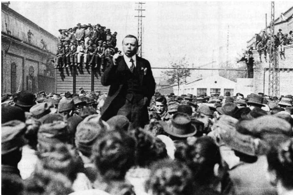
Béla Kun, leader of the 1919 Hungarian Revolution

Not that any of this was news; major politicians of the time knew it well. Lord Balfour, for example, once remarked to Wilson’s aide Edward House that “nearly all Bolshevism and disturbances of a like nature, are directly traceable to the Jews of the world. They seem determined either to have what they want or to upset present civilization.” [7]