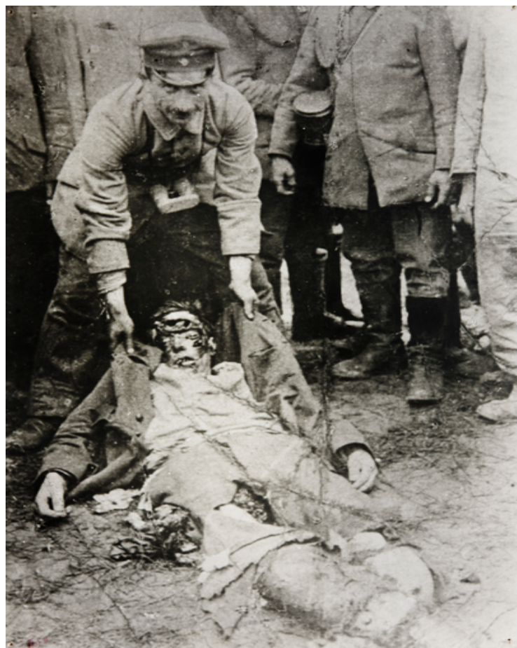
Photograph from the archives of the League of Nations shows a soldier killed in World War I. The war raged for more than four years, from August 1914 to November 1918, and resulted in the deaths of more than nine million combatants. As many as seven million civilians also were killed in the war or died as a consequence of it.