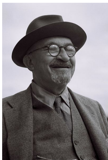
British Zionist and future President of Israel, Chaim Weizmann vowed Jewish support for the Second World War. Photo: 26 March 1949

Indeed: If Jewish influence in “our government” was part of the danger, then naming the “Roosevelt administration” was redundant. The true danger was Jews in media, Jews in Hollywood, and Jews in the government—along with those non-Jews who worked on their behalf. And even to name the British—Churchill and his Zionist backers—was, in effect, to name yet more Jews. On all fronts, it was powerful and influential Jews driving peaceful people toward war, simply to destroy the hated Nazi regime.