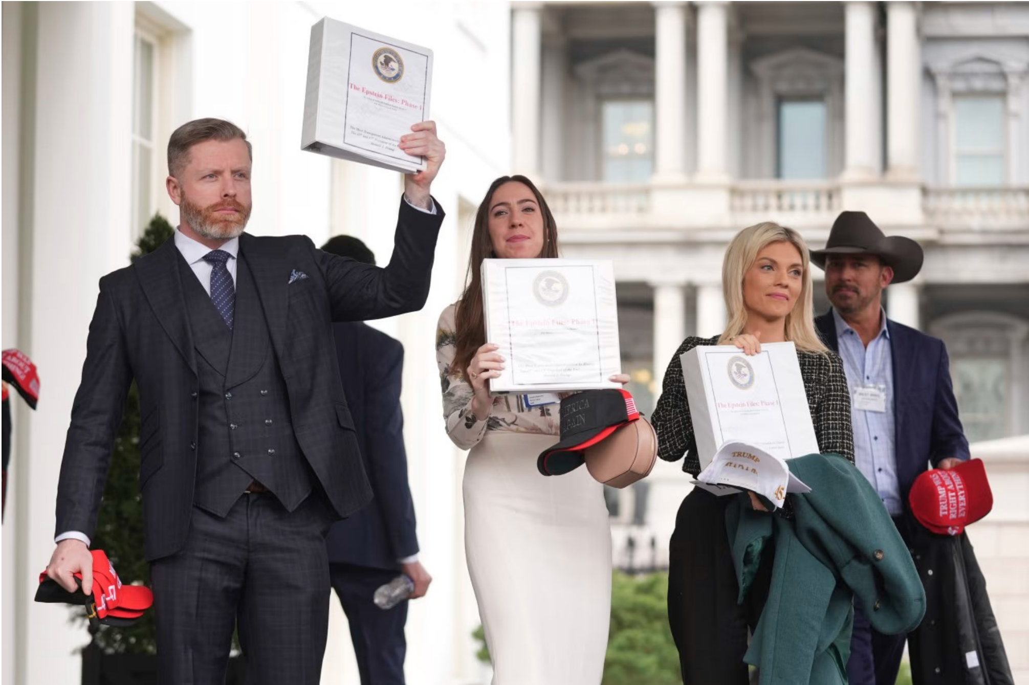
ATTORNEY GENERAL PAM BONDI RELEASED DOCUMENTS ON THE EPSTEIN CASE IN FEBRUARY. ABOVE, CONSERVATIVE INFLUENCERS AT THE WHITE HOUSE WITH THE DOCUMENTS.

Soon after she was confirmed as attorney general, Bondi said she was preparing to release new Epstein files. In late February, Bondi announced the release of “Phase 1” of the documents. But the material contained few new revelations, drawing criticism from right-wing influencers.