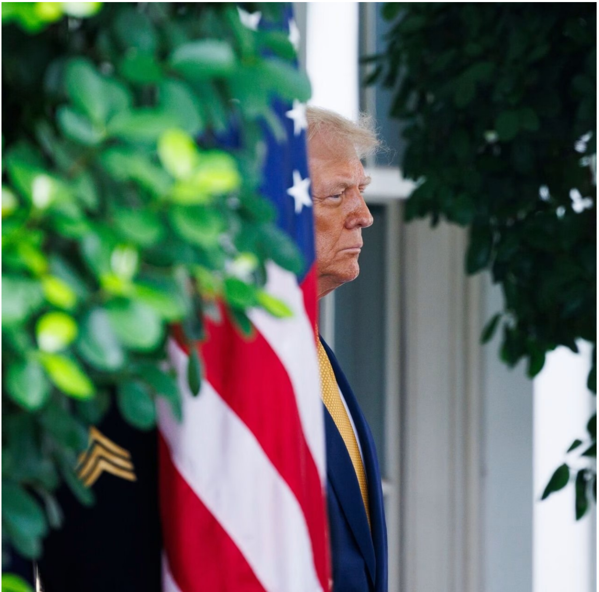
PRESIDENT TRUMP AT THE WHITE HOUSE ON WEDNESDAY.