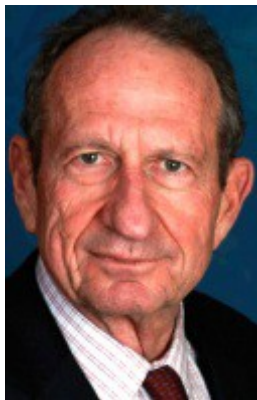
John M. Deutch