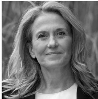
Monica Maggioni Deputy Chairman

Chairman of the Board of Directors, UBS Group AG, Zurich; former President of the Deutsche Bundesbank;