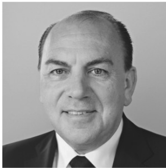
Axel A. Weber Chairman

Chairman of the Board of Directors, UBS Group AG, Zurich; former President of the Deutsche Bundesbank;