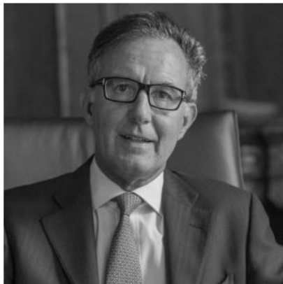
Paolo Magri European Director

WHO Special Envoy for the Access to COVID-19 Tools Accelerator; Co-Chair, European Council on Foreign Relations; former Prime Minister of Sweden