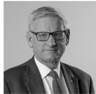
Carl Bildt Deputy Chairman

WHO Special Envoy for the Access to COVID-19 Tools Accelerator; Co-Chair, European Council on Foreign Relations; former Prime Minister of Sweden