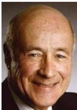
Joseph S. Nye, Jr.