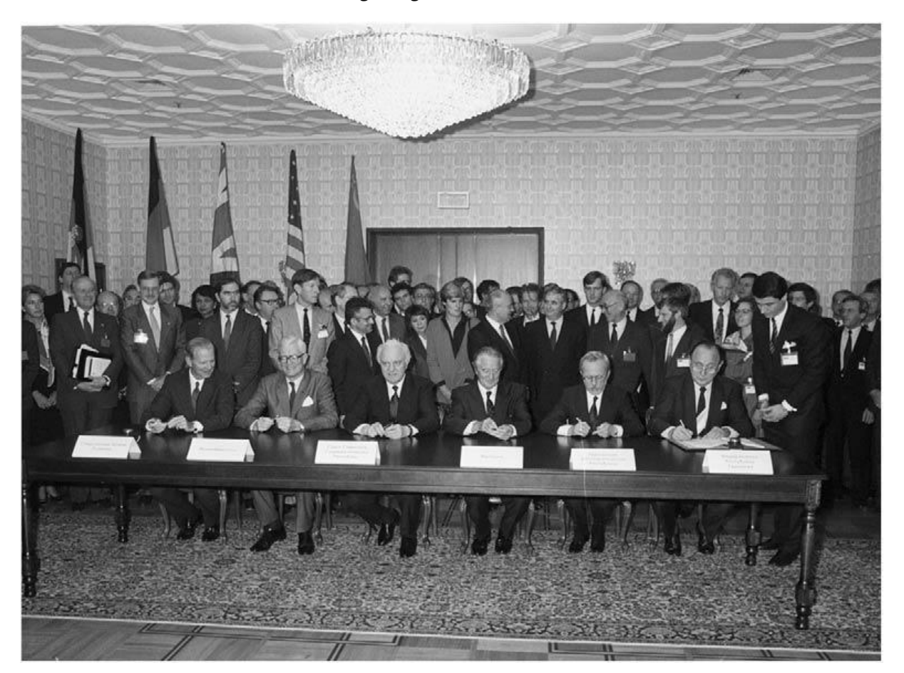
From right to left: Foreign Minister Hans-Dietrich Genscher (FRG), Minister President Lothar de Maizière (GDR), and Foreign Ministers Roland Dumas (France), Eduard Shevardnadze (USSR), Douglas Hurd (Great Britain), and James Baker (USA) sign the so-called Two Plus Four Agreement (Treaty on the Final Settlement with Respect to Germany) in Moscow on September 12, 1990.