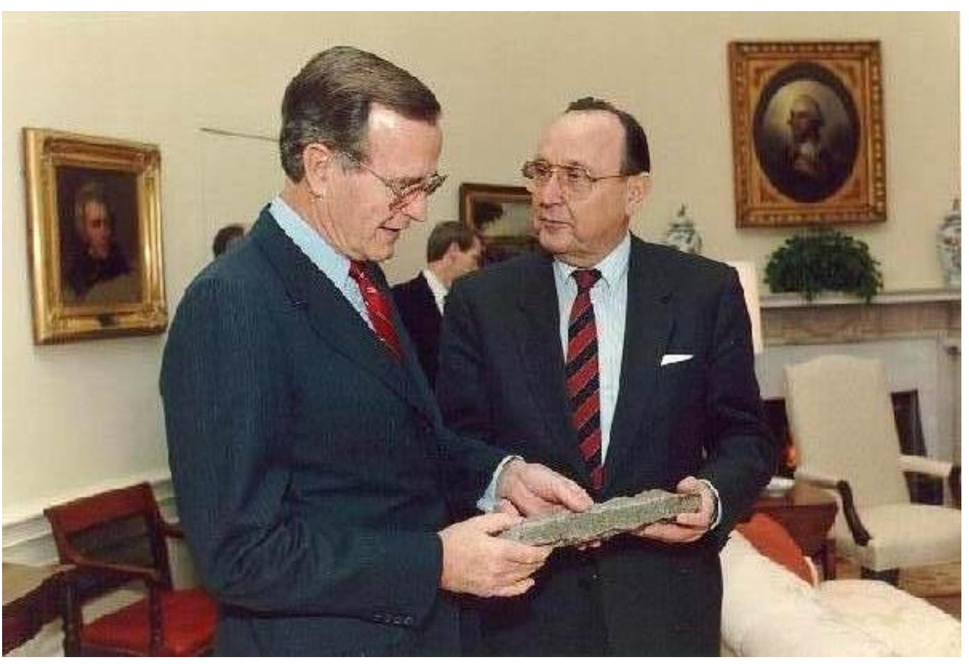
Foreign Minister Genscher presents President Bush with a piece of the Berlin Wall, Oval Office of the White House, Washington, D.C., November 21, 1989.