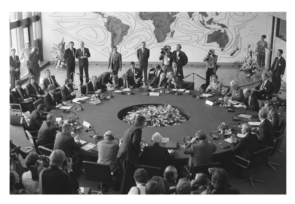
First official round of the Two Plus Four negotiations, with the six foreign ministers, in Bonn on May 5, 1990.