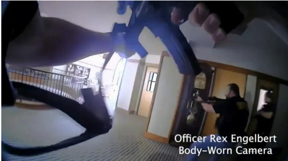
Still image from police body worn camera footage, showing police officers approaching Hale from behind in the second floor of the lobby just prior to her death.

The responding police officers then began searching for other attackers within the school. After confirming there were no active threats remaining in the school, police officers began evacuating students, faculty, and staff from within the building.