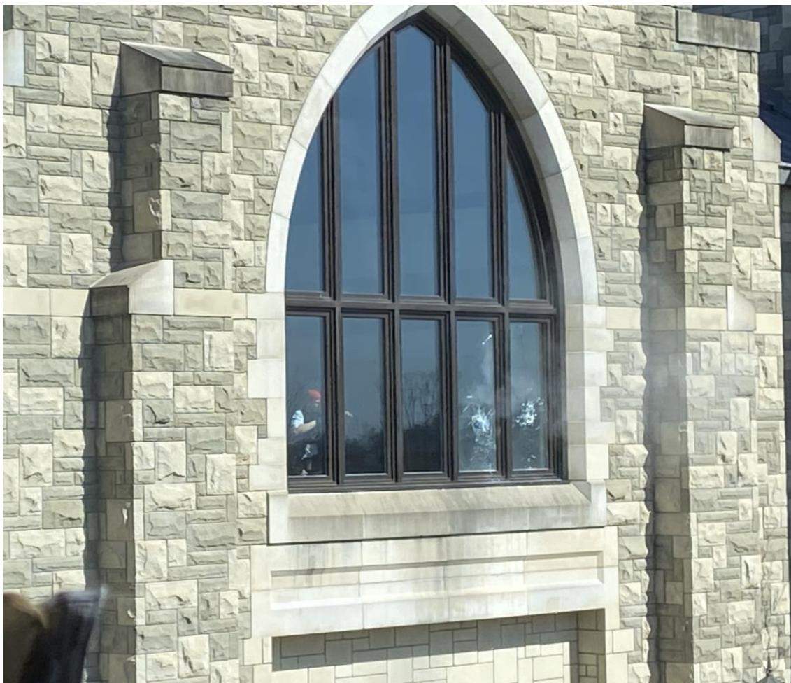
Photograph taken by a faculty member of the school while barricaded inside a room. This image shows Hale as she's firing upon police officers within the parking lot of the school.

For over two minutes, Hale fired multiple shots at police officers and police vehicles in the parking lot outside of the main entrance to the sanctuary. Though she didn't injure any officers, she did manage to disable at least two police vehicles by deflating tires. The gunfire forced some police officers to take cover behind their vehicles, and it appeared to occupy Hale completely during this time period.