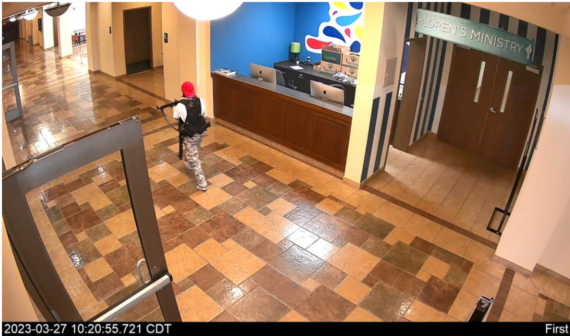
Still images from the video surveillance footage from The Covenant, showing Hale walking down the hallway past the cafeteria.

Upon reaching the end of the hallway and the doorway leading to the main lobby for the sanctuary, Hale encountered two television sets mounted on the wall in the student lounge. She fired multiple shots with her carbine at the television sets. She then observed a set of doors on the opposite side of the hallway. On the other side of those doors was the hallway leading to the pre-Kindergarten and Kindergarten classrooms. Hale then fired several shots with her AR pistol through those doors. Nobody was on the other side of those doors, and nobody was injured from those shots. Hale then ascended the second floor using a nearby stairwell.