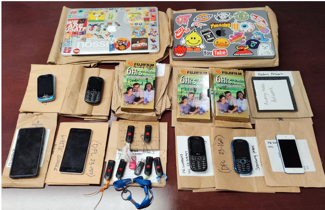
Photograph of the communications and memory storage devices, cassette tapes, and DVD seized from Hale during the investigation.