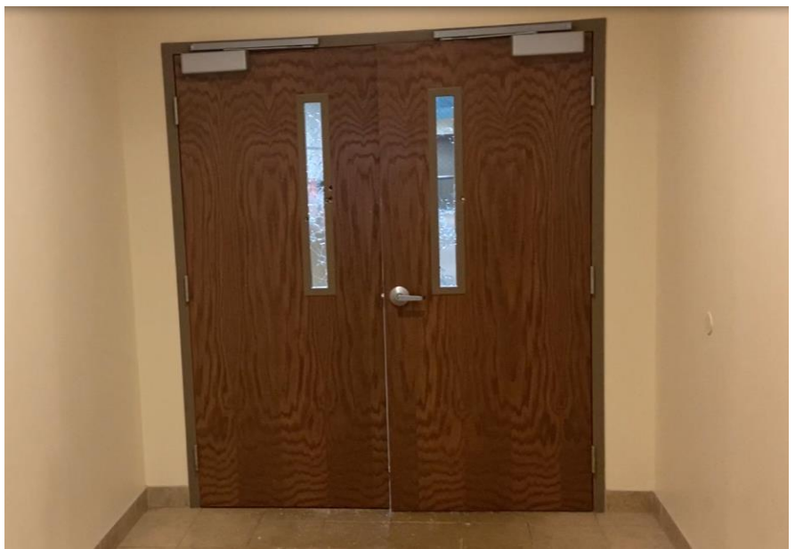
Photographs from the student lounge area on the first floor of The Covenant, taken by crime scene investigators following the homicides. The image on the left shows one of the television sets Hale shot. The image on the right shows the doors Hale fired through.