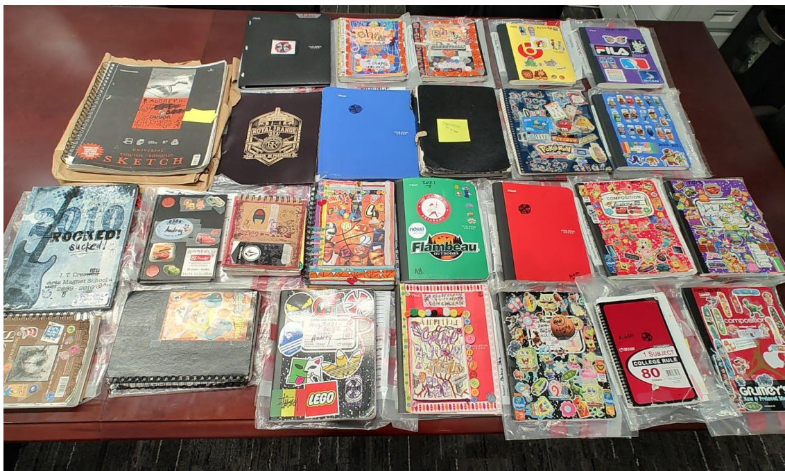
Photograph of the notebooks, composition books and sketchbooks, and folders recovered from Hale's bedroom during a search of her residence on March 27 th , 2023.

at least once a week. The margins of the page on most entries contained notes made by Hale, as well as corrections or clarifications regarding entries written between the lines. Some of the entries made within the lines were crossed out, with