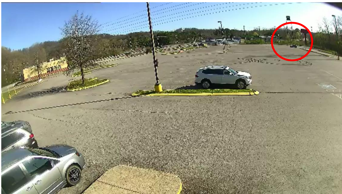
Still image from the video surveillance footage from Royal Range, USA, showing Hale parked at the location between 8:16 a.m. and 9:33 a.m. on March 27 th , 2023 (Hale's vehicle circled in red).

Hale then drove to Royal Range USA, located at 7741 U.S. Hwy. 70 S, Nashville, TN, arriving there at 8:16 a.m. Upon arriving at this location, she drove to a far corner of the parking lot, well away from the building and the entrance to the lot. Once there, she donned her tactical vest and affixed magazine pouches to her belt. The vest was loaded with several spare magazines, an automatic knife, and other equipment. She then assembled and loaded three different firearms. She then remained in her vehicle in the parking lot of the location for over an hour and finally left the location at 9:33 a.m.