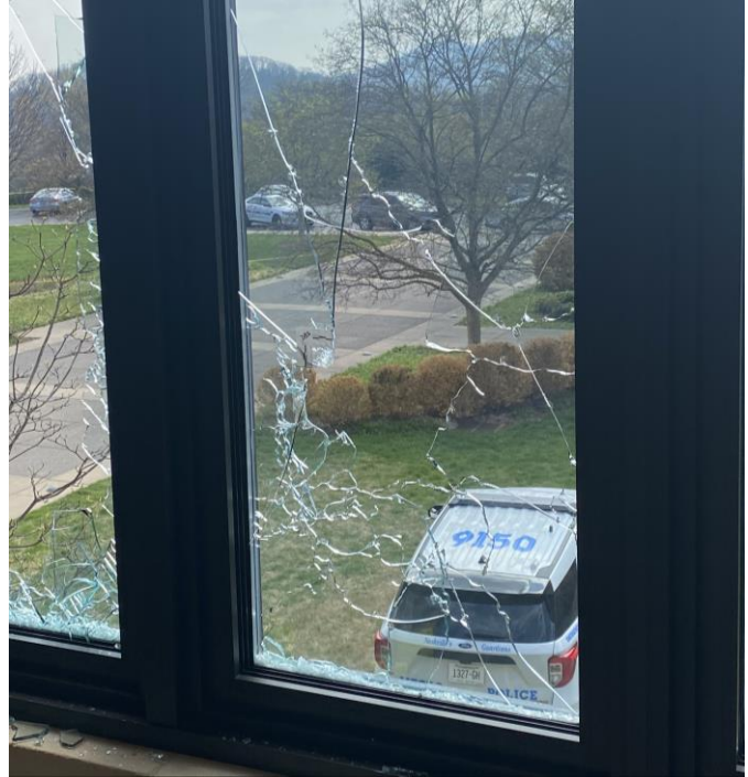
Photograph taken by crime scene investigators following the homicides, showing the vehicles Hale damaged in the distance.

As Hale fired upon the officers in the parking lot, other officers entered the school through a south entrance. These officers were initially unable to hear where the gunfire was coming from due to the layout of the school affecting acoustics. When they passed a stairwell leading to the second floor, they could hear the gunfire more clearly. Upon ascending to the second floor, they moved through the hallways towards the source of gunfire and eventually located Hale. Due to the audible fire alarm, the earplugs she was wearing throughout the attack, and the sound of her own gunfire, Hale never heard the police officers as they entered the lobby behind her. One officer then fired a 5.56mm caliber rifle at Hale, striking her and knocking her to the ground. As the officers approached Hale to take her into custody, they saw she still had possession of her firearms and her arms were moving. A second officer fired a 9mm caliber pistol at her. She was fatally wounded by the officers' gunfire.