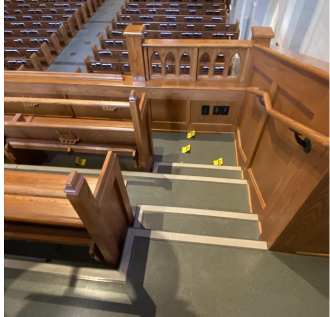
Photographs from the sanctuary of The Covenant, taken by crime scene investigators following the homicides. The image on the left shows the stained-glass window damaged by gunfire (the red circle highlights the defects to the window). The image on right shows the fired cartridge casings from Hale shooting through the window.

As Hale was moving through the school, police officers and paramedics were being dispatched to The Covenant. The first responding police officers arrived at the building at approximately 10:19 a.m. (at this point, Hale was searching the church offices on the second floor). None of the police officers arriving at the location had ever been inside the building or were familiar with its layout. Many didn't even know The Covenant existed prior to the homicides. The responding police officers came from several different precincts, investigative units, and other specialized units across the county.