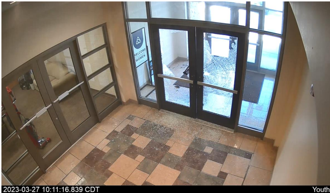
Still image from the video surveillance footage from The Covenant, showing Hale entering the building after shooting the glass out of the doors.

At 10:10 a.m., Hale began her attack. Upon reaching the entrance, Hale fired her AR pistol at the doors several times, shattering the glass within each door. The bullets also travelled into the vestibule and shattered the set of doors just inside the building. Hale then crawled through the shattered glass and entered the school.