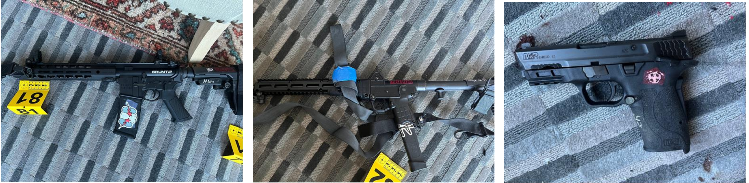
Photographs of Hale's firearms, taken following the murders by crime scene investigators.

At 10:10 a.m., Hale began her attack. Upon reaching the entrance, Hale fired her AR pistol at the doors several times, shattering the glass within each door. The bullets also travelled into the vestibule and shattered the set of doors just inside the building. Hale then crawled through the shattered glass and entered the school.