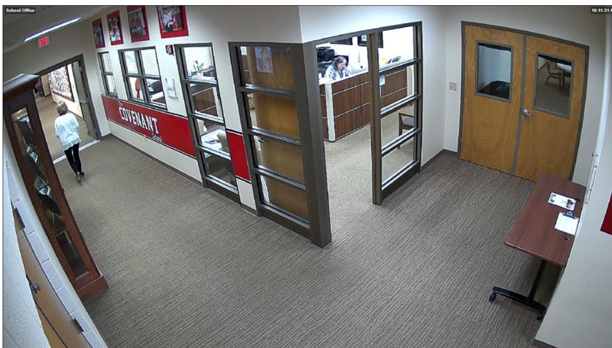
Still image from the video surveillance footage from The Covenant, showing Peak exiting the office area in response to the fire alarm.

At the time Hale was entering the school, Cynthia Peak was in the school office receiving her classroom assignment and lesson plan prior to working as a substitute teacher for the day. Upon hearing the fire alarm go off, Peak left the office area and walked to a stairwell to assist with the evacuation of the building. Other faculty and staff members inside the office area remained, with some attempting to investigate the source of the fire alarm.