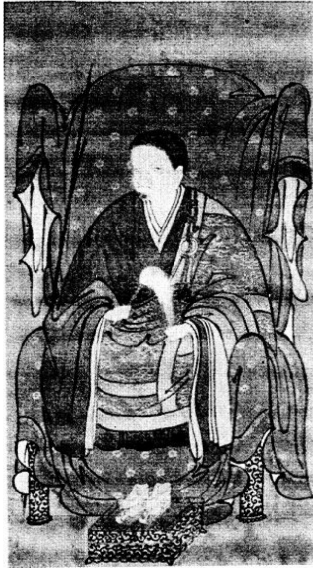
Portrait of Bankei, said to be a self-portrait. Property of the Yakushin-in, Kawasaki.