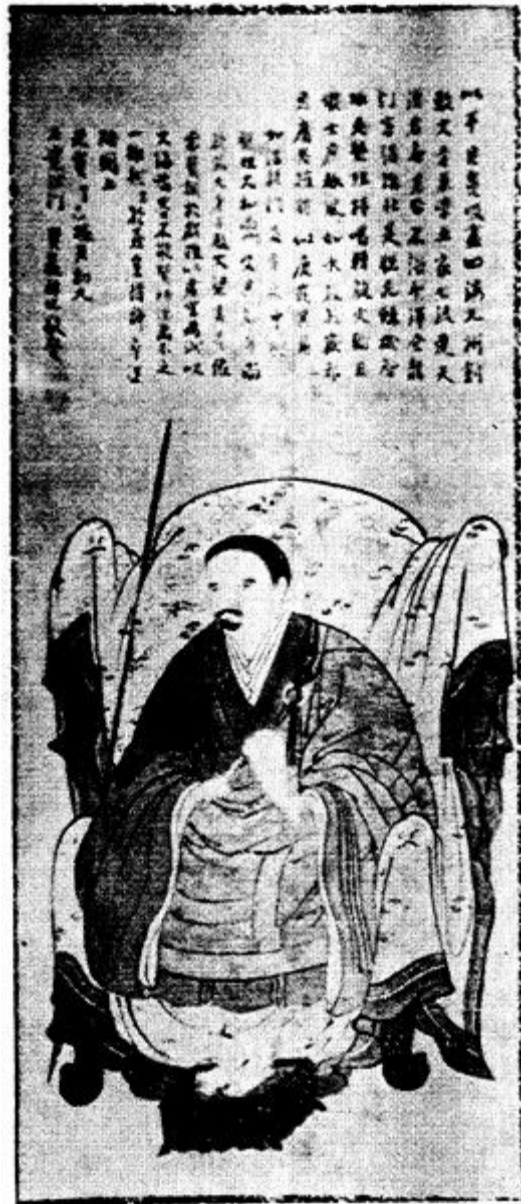
Portrait of Bankei, by the painter Yamamoto Soken (n.d.). The portrait was commissioned by Bankei's disciple Tairyō Sokyō (1638–1688). The san , or appreciatory verse, dated 1677, is by Bankei's colleague, the Rinzai Zen Master Kengan Zenetsu (1618–1696).