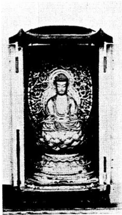
Statuette of Śākyamuni, carved by Bankei. Property of the Ryōmonji.