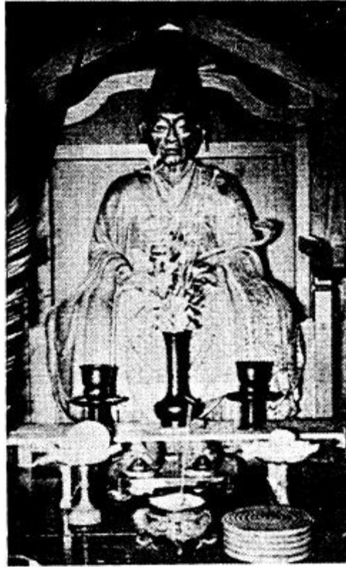
Statue of Umpo, carved by Bankei. Dated 1669. Property of the Zuiōji, Akao.