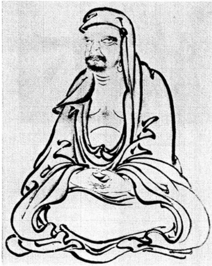
Bodhidharma. Painted by Bankei. Property of the Ryōmonji.