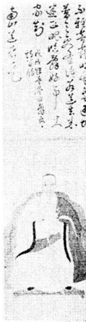
Portrait of Tao-che. Property of the Tafukuji, Usuki (Ōita Prefecture).