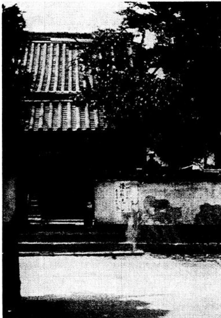
Main gate of the Hōshinji, Marugame. ( Courtesy Shunjūsha )

Calligraphy by Bankei. left : “Transcend the buddhas, transcend the patriarchs.” center . “ Ka! ” (a shout, the cry of enlightenment). right : “The pine is straight, the brambles bent.” Property of the Ryōmonji. ( Courtesy Shunjūsha )