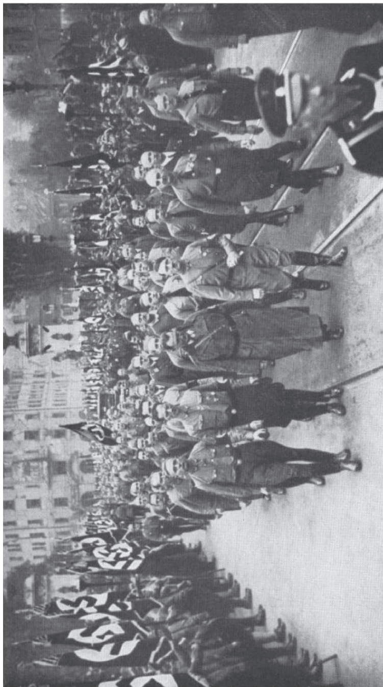
The Mtmch znr Feldherrnhalle e-ni i). November Behind dern A n h r r in the second row A ! fred Rvsenberg